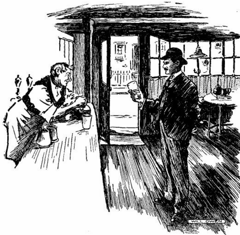
"Mr. Catesby made a few inquiries."

He was the only person in the bar, and the land-lord, a stout man in his shirt-sleeves, was the soul of affability. Mr. Catesby, after various general remarks, made a few inquiries about an uncle aged five minutes, whom he thought was living in Bashford's Lane.