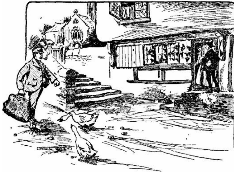
“ He saw the door just opening to admit the fortunate Herbert.”

He stayed away for nearly a week, and then one evening as he approached the house, carrying a carpet-bag, he saw the door just opening to admit the fortunate Herbert. He quickened his pace and arrived just in time to follow him in. Mr. Sims, who bore under his arm a brown-paper parcel, seemed somewhat embarrassed at seeing him, and after a brief greeting walked into the room, and with a triumphant glance at Mr. Gunnill and Selina placed his burden on the table.