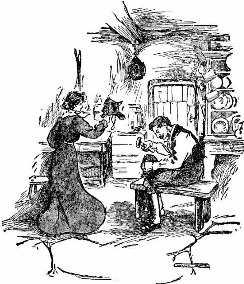
“ From the kitchen came sounds of hammering. ”

Miss Gunnill tossed her head, but after a little demur consented; and Drill, ignoring the impatience of the constable, picked up his bag and led the way into the kitchen. Messrs. Gunnill and Jenkins, left behind in the living-room, sought for some neutral topic of discourse, but in vain; conversation would revolve round hard labour and lost pensions. From the kitchen came sounds of hammering, then a loud "Ooh!" from Miss Gunnill, followed by a burst of laughter and a clapping of hands. Mr. Jenkins shifted in his seat and exchanged glances with Mr. Gunnill.