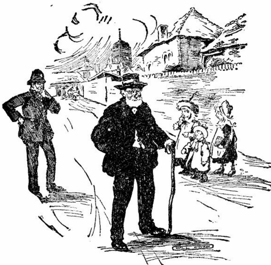
“The constable watched him with the air of a proprietor.”

Miss Gunnill's two principal admirers had an arduous task to perform. They had to attribute Mr. Gunnill's disaster to the vindictiveness of Cooper, and at the same time to agree with his daughter that it served him right. Between father and daughter they had a difficult time, Mr. Gunnill's sensitiveness having been much heightened by his troubles.