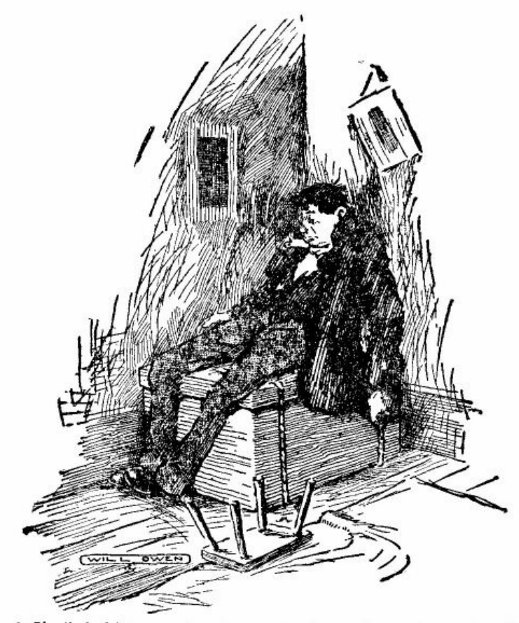
"6 Charlie had 'ad as much as 'e wanted and was lying on the sea-chest."

Charlie gave a growl and rushed at 'im, and the next moment 'e was down on the floor with the 'ardest bang in the face that he'd ever 'ad in 'is life. Mrs. Dixon screamed and ran into the kitchen, follered by old Burge, who went in to tell 'er not to be frightened. Charlie got up and went for Dixon agin; but he 'ad come back as 'ard as nails and 'ad a rushing style o' fighting that took Charlie's breath away. By the time Bob 'ad left the bar to take care of itself, and run round and got in the back way, Charlie had 'ad as much as 'e wanted and was lying on the sea-chest in the corner trying to get 'is breath.