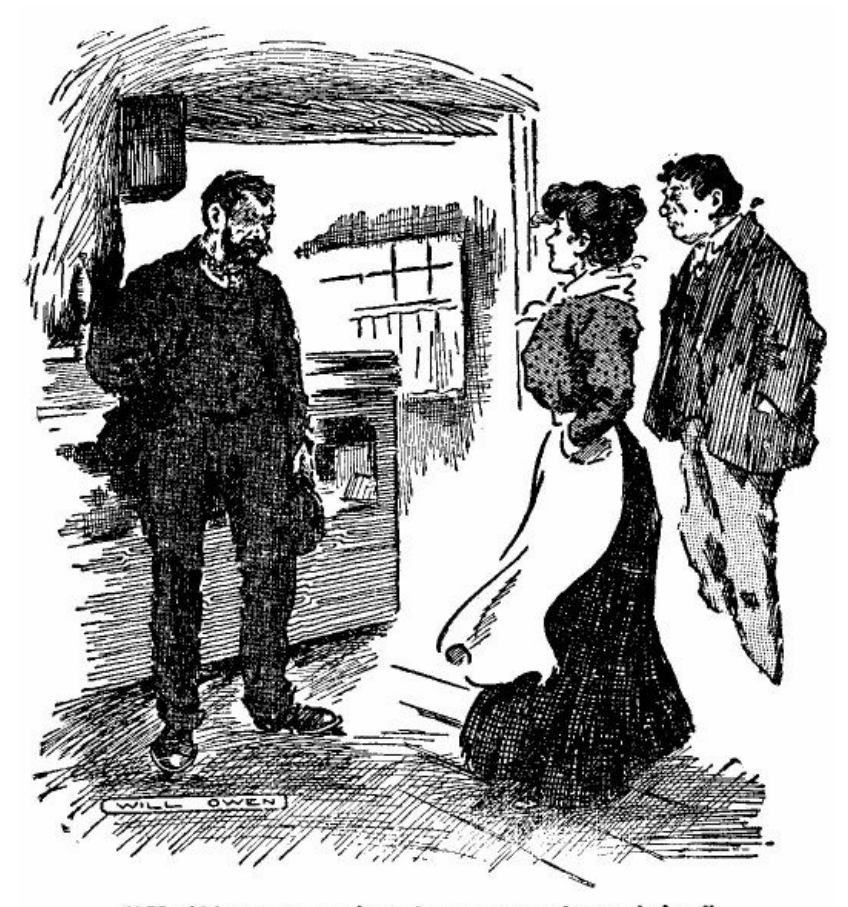
"You'd better go upstairs and put on some decent clothes."

"Nobody asked you to run away," ses his wife, edging away as he went to put his arm round 'er waist. "You'd better go upstairs and put on some decent clothes."