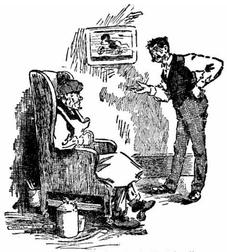
" Go and sleep somewhere else, then,' ses Dixon."

"Go and sleep somewhere else, then," ses Dixon. "I don't want you 'ere at all, or your boys neither. Go and give somebody else a treat; I've 'ad enough of the whole pack of you."