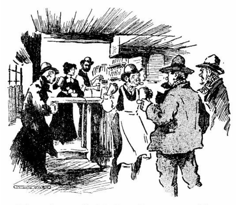
"The way she answered her 'usband was a pleasure to every married man in the bar."

landladies I've ever seen, she was the best, and on'y to 'ear the way she answered her 'usband when he spoke to 'er was a pleasure to every married man in the bar.