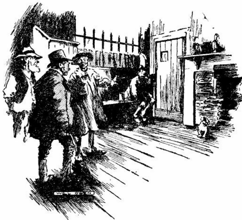
“ In a pitiable state of ‘ nerves ’ he sat at the extreme end of a bench.”

Mr. Carter called for some more beer and told the barmaid to put a little gin in it. In a pitiable state of "nerves" he sat at the extreme end of a bench, and felt that he was an object of unwholesome interest to his acquaintances. The finishing touch was put to his discomfiture when a well-meaning friend in a vague and disjointed way advised him to give up drink, swearing, and any other bad habits which he might have contracted.