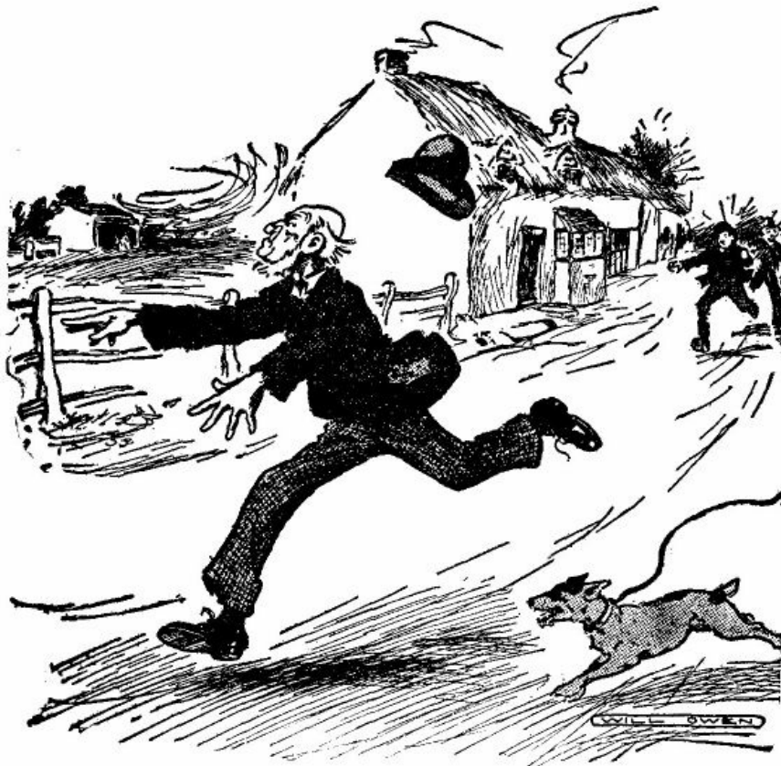
"He was running along to Bob Pretty's as fast as 'is legs would take 'im."

Dicky Weed didn't answer 'im; he was already running along to Bob Pretty's as fast as 'is legs would take 'im, with most of us follering behind to see wot 'appened.