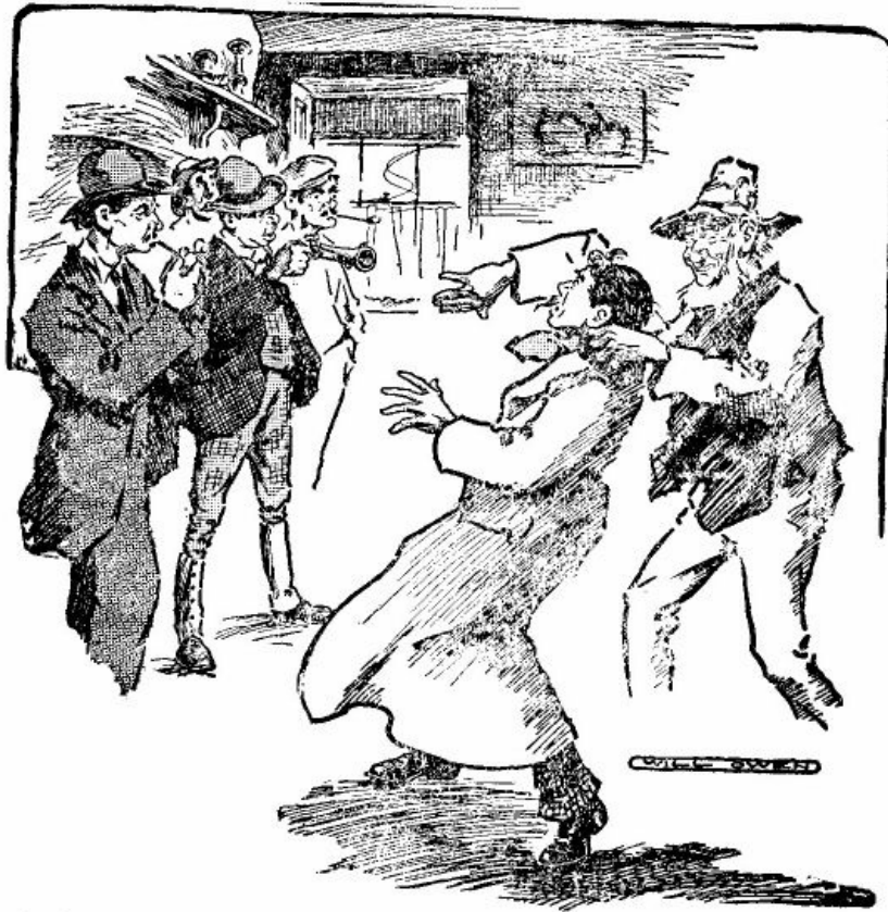
“The scream 'e gave as George Kettle pointed the pistol at 'im was awful.”

Bill Chambers laid 'old of 'im just as he was going through the door to fetch the landlord, and the scream 'e gave as he came back and George Kettle pointed the pistol at 'im was awful.