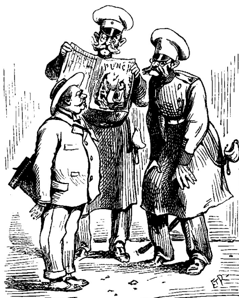
"Suddenly from their awful manner, their frowns, and violent expressions, it occurred to me, 'Hang it all! They take me for a Jew!'"—Extract from Letter from Our Yotting Yorick .

wittles and drink during the whole of the voyage,—humorous again, eh? It's in me, only there's a depression in the Baltic. Why call it Baltic? Nobody on board knows) outside the fortress of St. Peter and St. Paul. I daresay there's some legend about their having built it, but, as I remarked before, my knowledge of the Russian tongue is limited to what I get dried for breakfast , and that doesn't go far when there are many more than myself alongside the festive board—and so I couldn't get any explanation. But I managed to sneak inside the fortress—and then,— lost my way!!! Couldn't get out. "If you want to know your way, ask a Policeman" in London, and, in St. Petersburg, ask a Bobbiski. Here's one with a sword—at least, I think he's one. I said, "Please, Sir, which way?" Then I tried him with French—"Où est," says I, " le chemin pour aller out of (I couldn't remember the French for 'out of') cette confounded fortress?" He wouldn't understand me. I tipped him a wink—I tipped him a two-shilling piece. It wasn't enough I suppose, as he called another fellow. The other chap came up,—what he was I don't know—but suddenly, from their awful manner, their frowns, and violent expressions, it occurred to me, "Hang it all! they take me for a Jew!" Never was so alarmed. With great presence of mind I pointed to my nose—they saw the