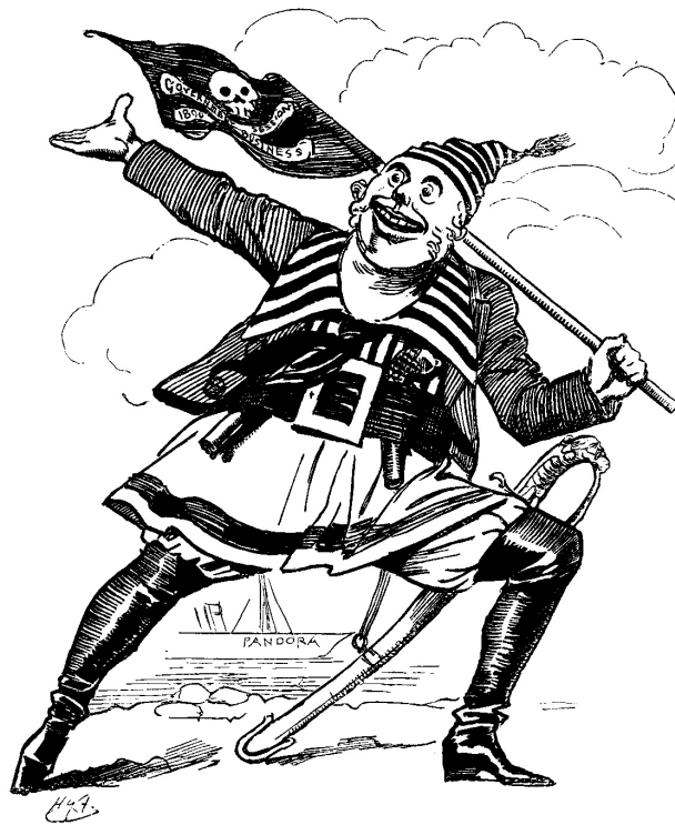
W.H. SMITH AS "THE ROVER OF THE SEAS."