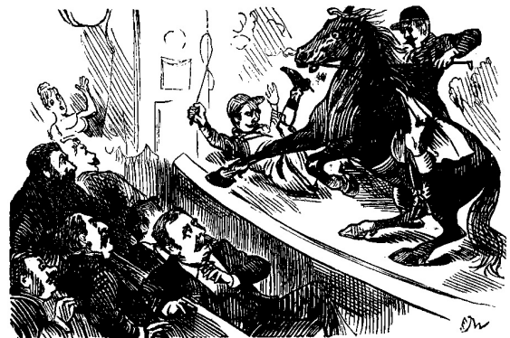
RISING TO THE SITUATION!

One of the greatest attractions in Town to the Country Cousin I need scarcely say is the Theatre. Speaking for myself, it is the place I earliest visit when I get to London, and consequently I was not surprised to find myself the other evening in the Adelphi, on the first night of a new play. As an Irishman might guess, from its name ( The English Rose ), the piece is all about Ireland. Both State and Church are represented therein—the former by a comic serjeant of the Royal Constabulary, and the latter by a priest, who wears a hat in the first Act that would have entirely justified his being Boycotted. The plot is not very strong, and suggests recollections of the Flying Scud , Arrah Na Pogue , and The Silver King . The acting is fairly satisfactory, the cast including a star, supported