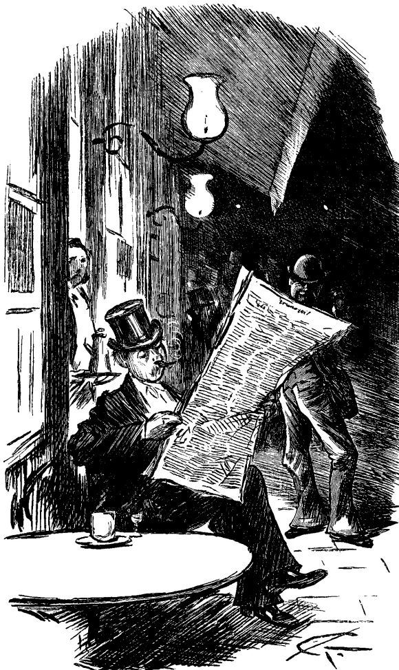
'ARRY ON THE BOULEVARDS.

And a fortnight at Margit meant yum-yum to