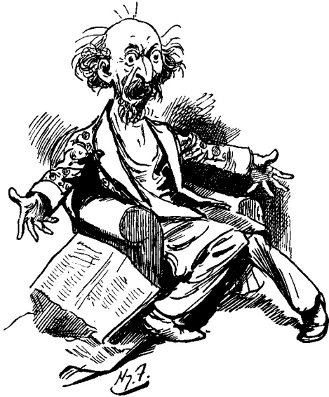
FANCY PORTRAIT OF ALGERNON CHARLES SWINBURNE.

On reading the Parliamentary report in Wednesday's Times .