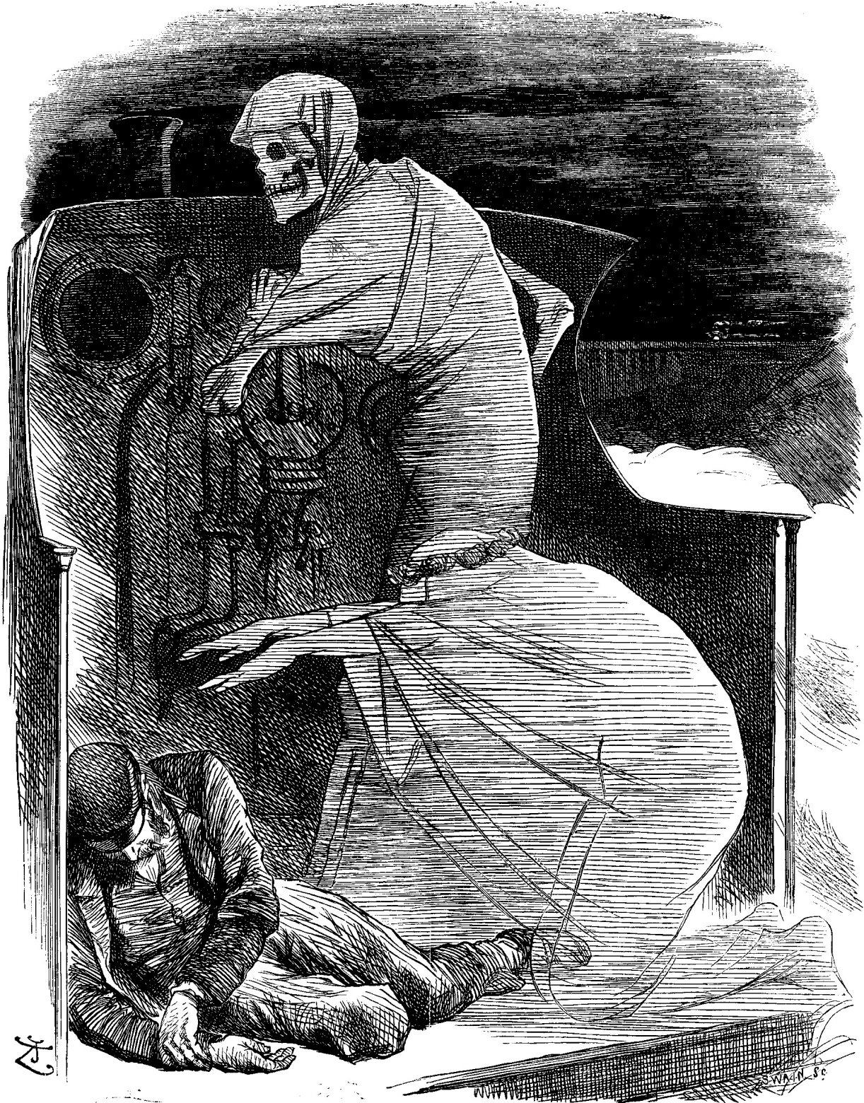
"DEATH AND HIS BROTHER SLEEP."