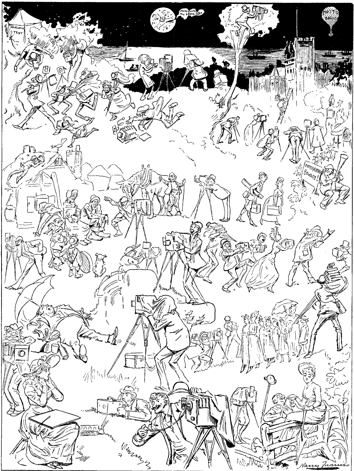
THE AMATEUR PHOTOGRAPHIC PEST.