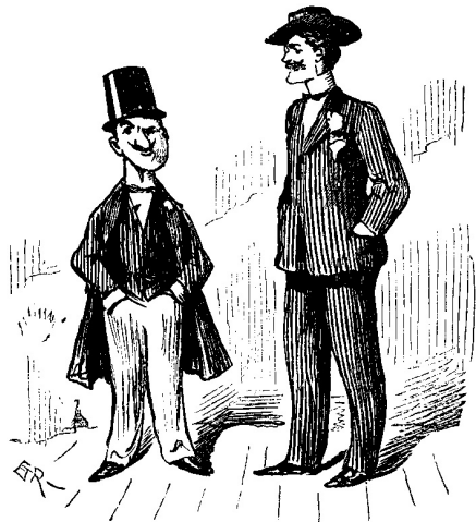
Alexander the Less and the preux Chevalier.

strongly reminding a public which knows its DICKENS of the story of Little Em'ly , with Vaillant for Old Peggotty , Lydie for Little Em'ly , Antonin Caussade for Ham , and Paul Astier for Steerforth . Perhaps it would be carrying the resemblance too far to see in Rosa Dartle , with her scorn For "that sort of creature," the germ of Esther de Sélény . Mix this with a situation from Le Monde où l'on s'ennuie , spoilt in the mixing, and there's the drama.