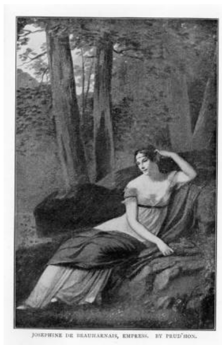
JOSEPHINE DE BEAUHARNAIS.