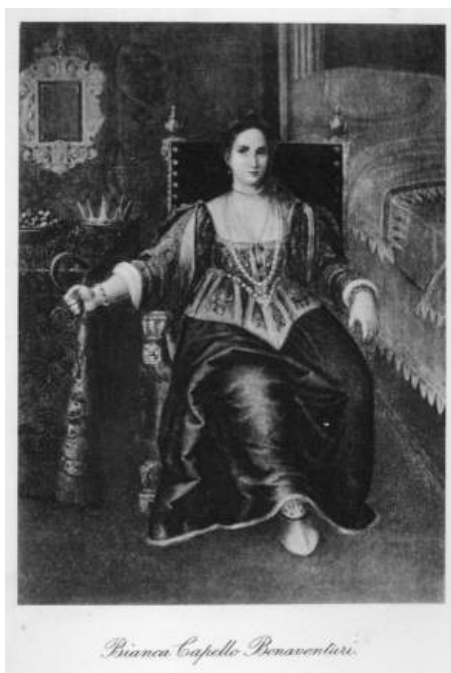
BIANCA CAPELLO BONAVENTURI.

More than three centuries have gone since Florence made merry over the death of her Grand Duchess, Bianca. It was an occasion for rejoicing; her name was bandied from lips to lips—"La Pessima Bianca"; jeers and laughter followed her to her unmarked grave in the Church of San Lorenzo. But through the ages her picture has come down to us as she strutted on the world's stage in all her pride and beauty, with a vividness which few better women of her time retain.