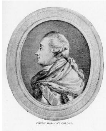
COUNT GREGORY ORLOFF.