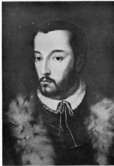
FRANCESCO I., GRAND DUKE OF TUSCANY.

In the solemn lying-in-state that followed Bianca had no place. Francesco alone, by his brother's orders, wore his crown in death. As for Bianca, her body was hurried away and flung into the common vault of San Lorenzo, with the light of two yellow wax torches to bear it company, and the jibes and jeers of Florence for its only requiem.