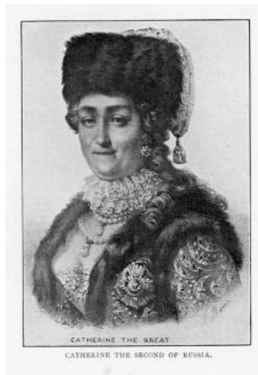
CATHERINE THE SECOND OF RUSSIA.

When Sophie Augusta Frederica of Anhalt-Zerbst was romping on the ramparts or in the streets of Stettin with burghers' children for playmates, he would have been a bold prophet who would have predicted that one day she would be the most splendid figure among Europe's sovereigns, "the only great man in Europe," according to Voltaire, "an angel before whom all men should be silent"; and that, while dazzling Europe by her statesmanship and learning, she would afford more material for scandal than any woman, except perhaps Christina of Sweden, who ever wore a crown.