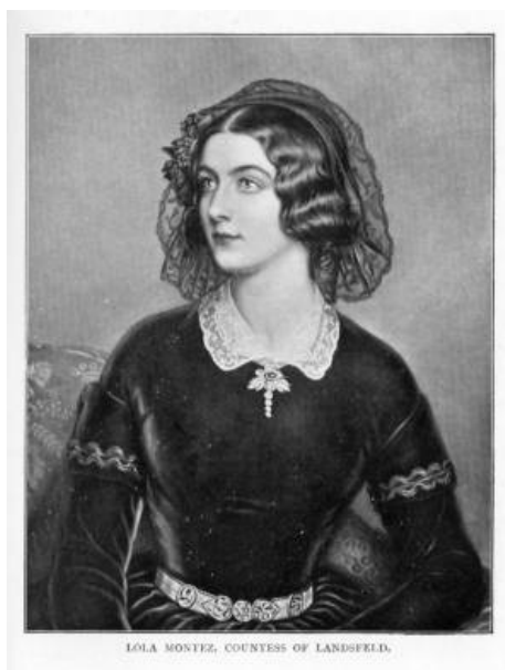
LOLA MONTEZ, COUNTESS OF LANDSFELD.

More than fifty years have gone since the penitent soul of Lola Montez took flight to its Creator;