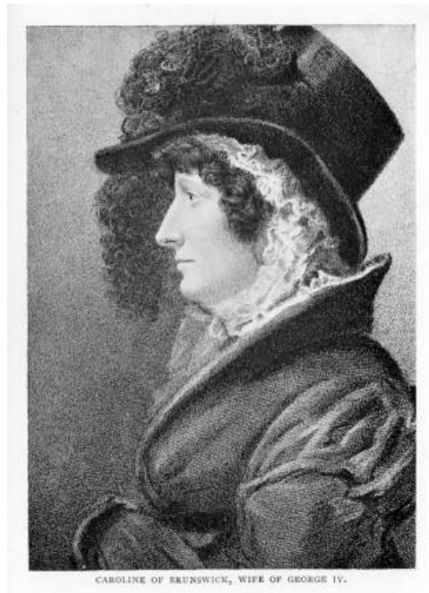
CAROLINE OF BRUNSWICK, WIFE OF GEORGE IV.

It was an ill fate that brought Caroline, Princess of Brunswick-Wolfenbüttel to England to be the bride of George, Prince of Wales, one April day in the year 1795; although probably no woman has ever set forth on her bridal journey with a lighter or prouder heart, for, as she said, "Am I not going to be the wife of the handsomest Prince in the world?" If she had any momentary doubt of this, a glance at the miniature she carried in her bosom reassured her; for the pictured face that smiled at her was handsome as that of an Apollo.