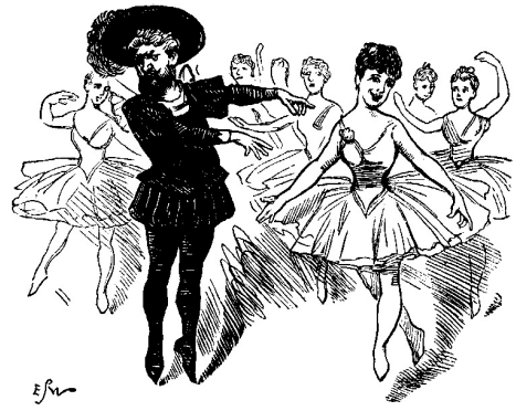
Hamlet is out of it in the last Act. Why wasn't he brought into the Ballet?