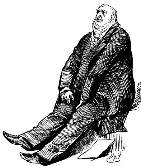
The British Constitution.

This is merely an incident in the struggle, illustrating one of the embarrassments it has evolved. Only man thoroughly happy is HARCOURT. He invented the line of attack on ground of breach of constitutional usages; put up Mr. G. to make his speech; supplied him with authorities, and in supplementary speech amazed House with his erudition. Made stupendous speech last night; literally gorged the House; to-night picks up fragments and provides another feast: six baskets wouldn't hold it.