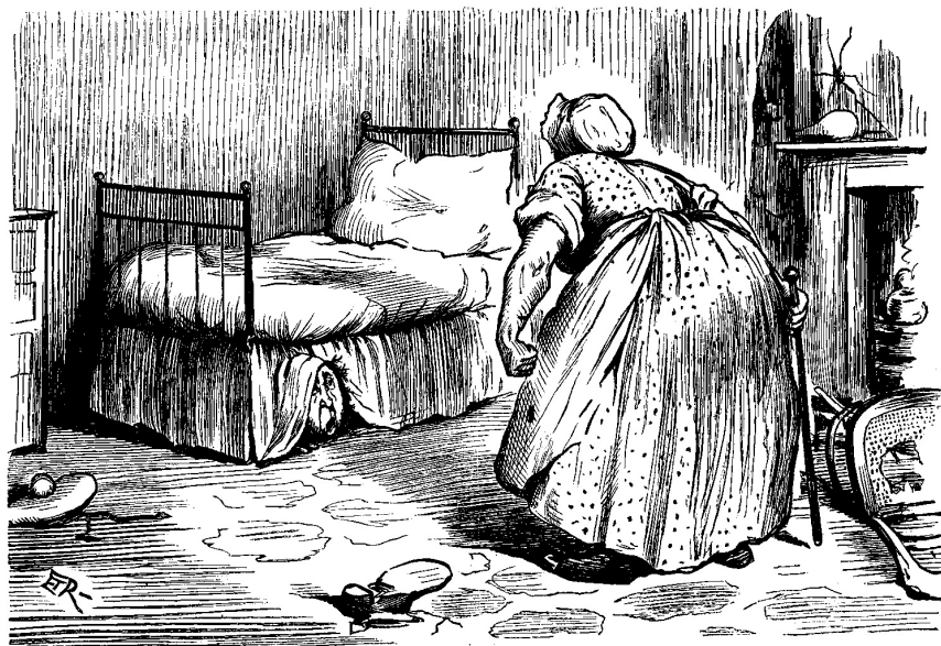
A "SCENE" IN THE HIGHLANDS.

Ill-used Husband (under the Bed). "AYE! YE MAY CRACK ME, AND YE MAY THRASH ME, BUT YE CANNA BREAK MY MANLY SPERRIT. I'LL NA COME OOT!!"