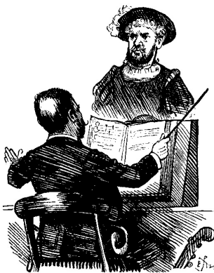
Hamlet Personally Conducted.