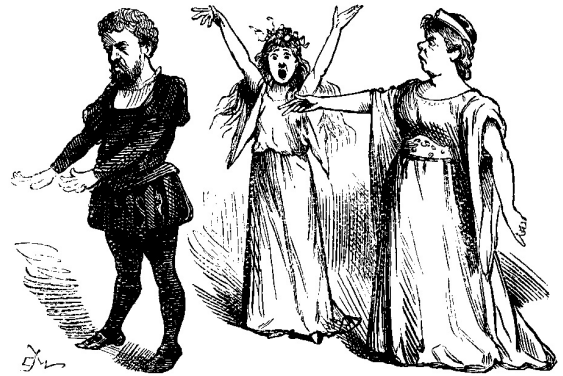
An awkward moment for Hamlet. Row with his Mother and Ophelia.