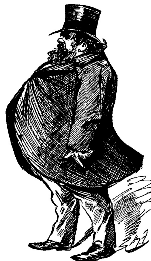
Another Noble Baron.