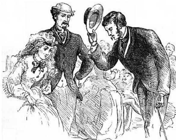
"Let me present my friend, Mr. Seymour."

Carryl came up with the lady on his arm; and as he stood there for a moment, in the coolest, most indifferent tone in the world, said, "Oh! by the by, Miss Ellis, let me present my friend Mr. Seymour."