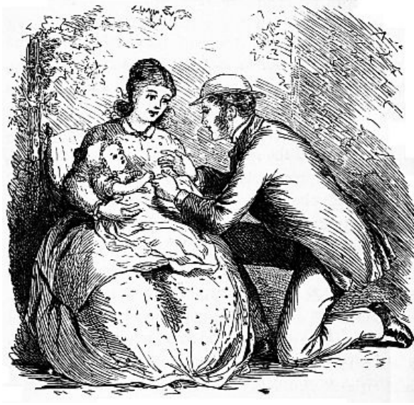
"An' it's a blessin' they brings wid 'em, sir."

"An' it's a blessin' they brings wid 'em to a house, sir; the angels comes down wid 'em. We can't see 'em, sir; but, bless the darlin', she can. And she smiles in her sleep when she sees 'em."