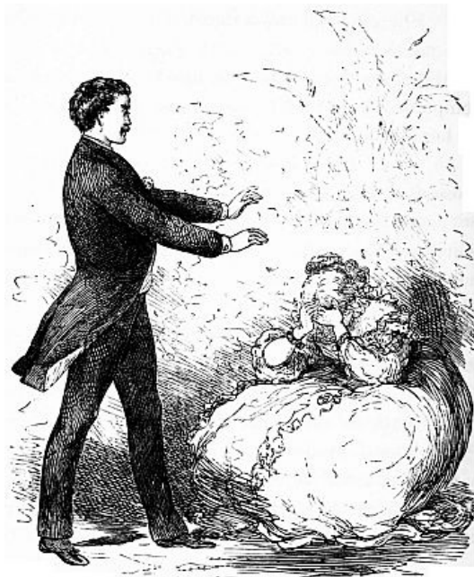
"She saw him, with an angry frown, push Lillie from him."

"Mr. Endicott," she said, "I have to ask a favor of you. Will you be so good as to excuse me from the 'German' to-night, and order my carriage?"