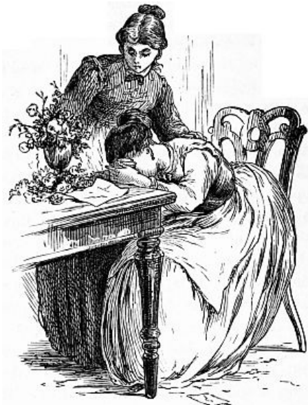
"She laid her head forward on the table."

"John engaged to Lillie Ellis?" said Miss Ferguson, in a tone of shocked astonishment.