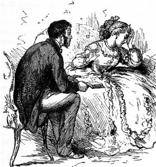
“I never had the least head for figures.”

“But, Lillie, please let me show you,” persisted John. “I’ve made it just as simple as can be.”