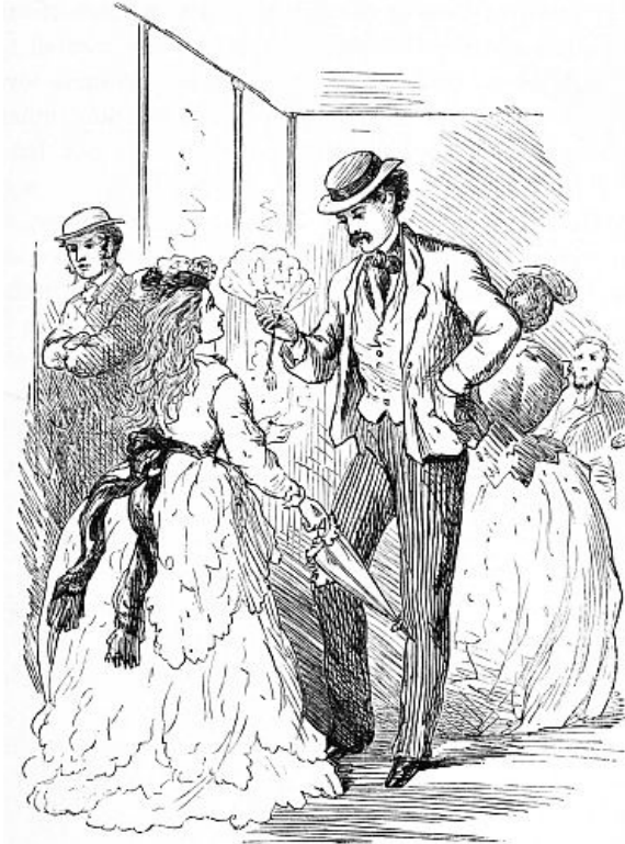
"I didn't know he was such a puppy."

"I didn't know he was such a puppy!" said John to himself, as he stood in a sort of angry bashfulness, envying the man that was so familiar with that loveliness.