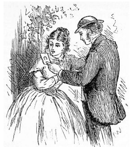
"It is a very sweet face."

"Ah, yes, exactly! You see she went into company, as a young lady, when she was only thirteen. She told me all about it. Her parents were very injudicious, and they pushed her forward. She [37]