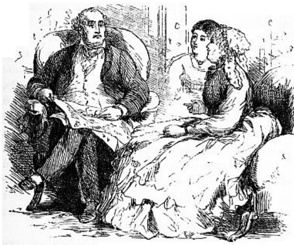
THE VAN ASTRACHANS.

"Yes, Rose," said Mr. Van Astrachan, "you mayn't believe it, but ma there was the spryest dancer of any of the girls. You are pretty nice to look at, but you don't quite come up to what she was in those days. I tell you, I wish you could have seen her," said the good man, warming to his subject. "Why, I've seen the time when every fellow on the floor was after her." [260]