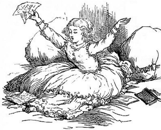
“Shrewd Miss Clippins detected the yawn.”

“He’ll get over it after he’s been married six months,” said Miss Clippins, nodding her head with the air of a woman that has seen life.