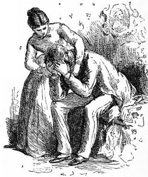
"O Gracie! I wish I was dead!"

"The power of loving may be undeveloped in her, John; but it will come, perhaps, later in life. At all events take this comfort to yourself,—that, when you are doing your duty by your wife, when you are holding her in her place in the family, and teaching her child to respect and honor her, you are putting her in God's school of love. If we contend with and fly from our duties, simply because they gall us and burden us, we go against every thing; but if we take them up bravely, then every thing goes with us. God and good angels and good men and all good influences are working with us when we are working for the right. And in this way, John, you may come to happiness; or, if you do not come to personal happiness, you may come to something higher and better. You know that you think it nobler to be an honest man than a rich man; and I am sure that you will think it better to be a good man than to be a happy one. Now, dear John, it is not I that say these things, I think; but it seems to me it is what our mother would say, if she should speak to you from where she is. And then, dear brother, it will all be over soon, this life-