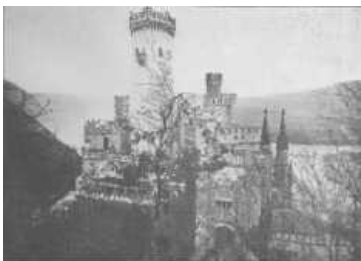
STOLZENFELS CASTLE ON THE RHINE