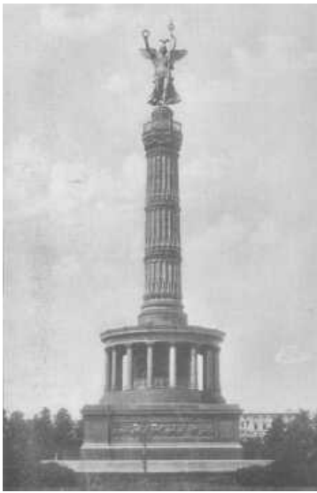
THE COLUMN OF VICTORY IN BERLIN