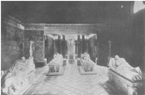
THE MAUSOLEUM AT CHARLOTTENBURG