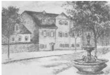
SCHILLER'S HOUSE IN WEIMAR