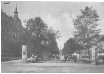
BERLIN: UNTER DEN LINDEN