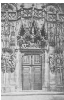
THE DOOR OF STRASSBURG CATHEDRAL