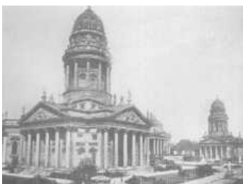
BERLIN: THE GENDARMENMARKT