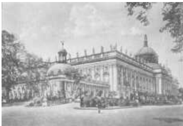
THE NEW PALACE AT POTSDAM