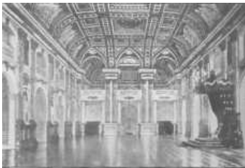
BERLIN: THE WHITE HALL IN THE ROYAL CASTLE