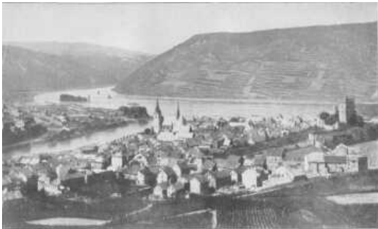
BINGEN ON THE RHINE