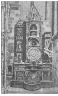
THE STRASSBURG CLOCK