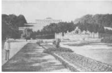
THE ROYAL PALACE OF SCHÖNBRUNN, NEAR VIENNA (The man on the sidewalk at the left is the Emperor Francis Joseph)