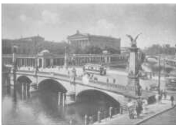
BERLIN: THE NATIONAL GALLERY AND FREDERICK'S BRIDGE