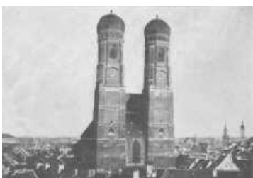
THE FRAUENKIRCHE, MUNICH