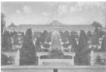
THE CASTLE OF SANS SOUCI, POTSDAM