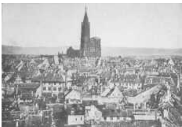
STRASSBURG AND THE CATHEDRAL