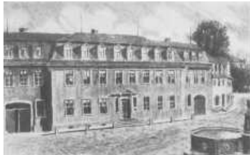
GOETHE'S HOUSE IN WEIMAR