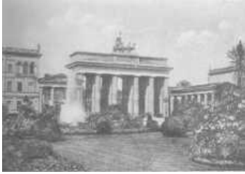
BERLIN: THE BRANDENBURG GATE