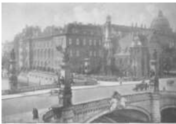
BERLIN: THE ROYAL CASTLE AND EMPEROR WILLIAM BRIDGE