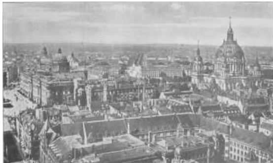
BERLIN: PANORAMA FROM THE TOWER OF THE TOWN HALL

Note: This text includes only Germany, and those parts of Austria-Hungary noted in the table of contents. Volume VI is available as a separate text within Project Gutenberg] See https://www.gutenberg.org/etext/11179