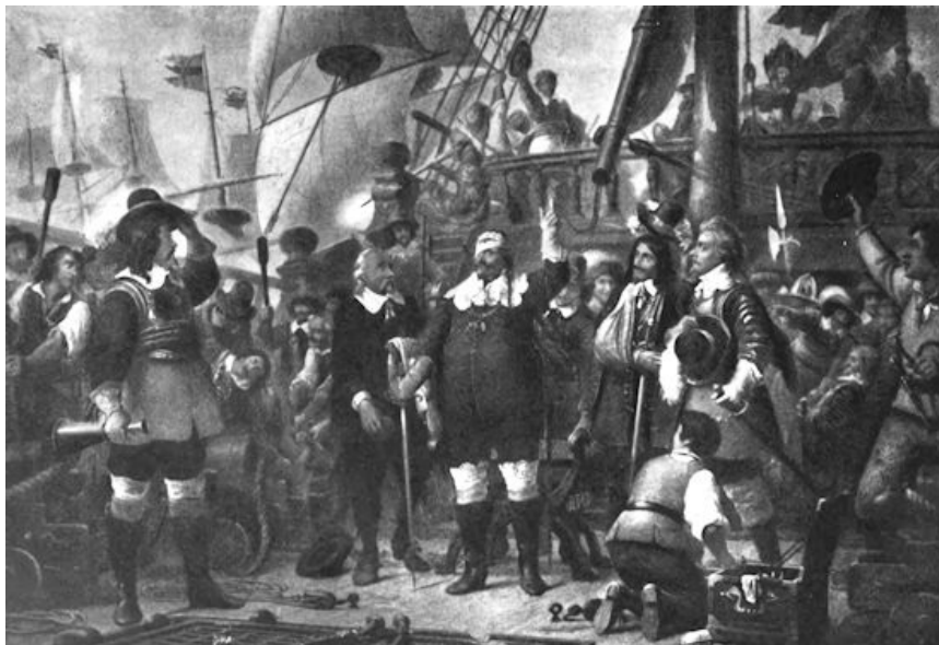
CHRISTIAN IV AT THE BATTLE OF KOLBERGER HEIDE

The cry was raised that the King was dead and panic spread on board. The story has it that a sailor was sent aloft to strike the flag but purposely entangled it in the rigging so that it could not fall; he could not bear to see the King's ship strike its colors. In the midst of the tumult the aged monarch rose to his feet, torn and covered with blood. "I live yet," he cried, "and God has left me strength to fight on for my country. Let every man do his duty." Leaning on his sword, he led the fight until darkness fell and the battle was won. Denmark was saved. The danger of an invasion was averted. In the palace of Rosenborg the priceless treasure they show to visitors is the linen cloth, all blood-stained, that bound the King's face as he fought and won his last and biggest fight that day.