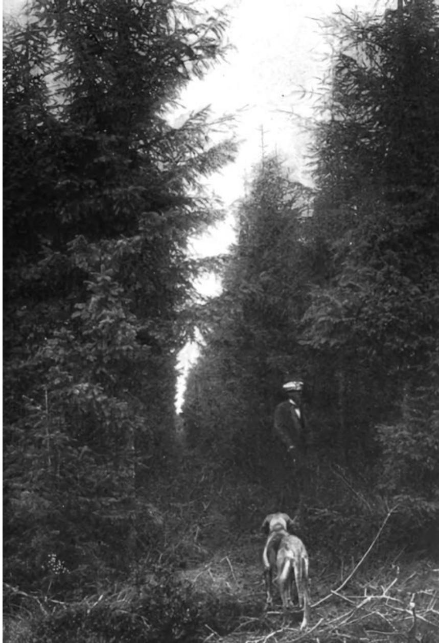
THE HEATH TRANSFORMED IN TWENTY-ONE YEARS

turned dairy farmer, and associations for irrigation, for tree planting, and garden planting are everywhere. They even reach across the ocean. This year a call was issued to sons of the old soil, who have found a new home in America, to join in planting a Danish-American forest in the desert where hill and heather hide a silvery lake in their deep shadows and returning wanderers may rest and dream of the long ago.