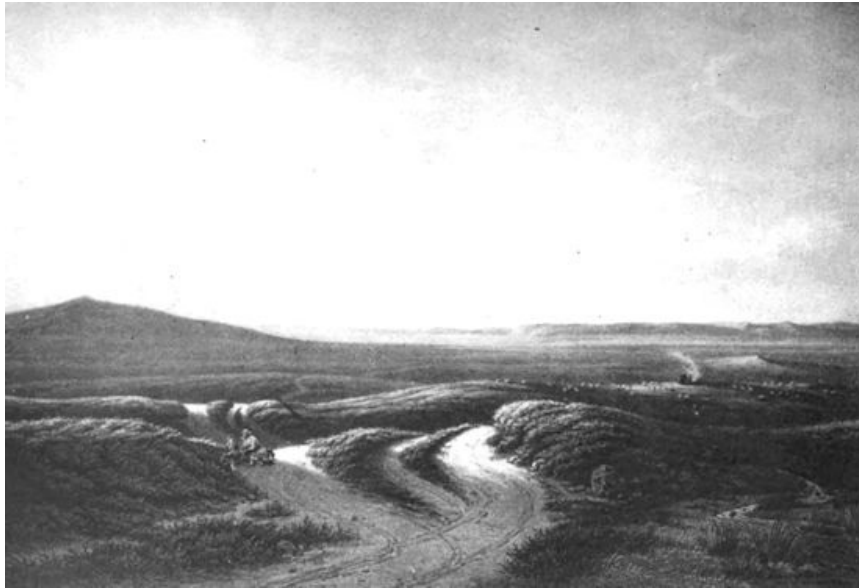
THE HEATH AS IT WAS FIFTY YEARS AGO