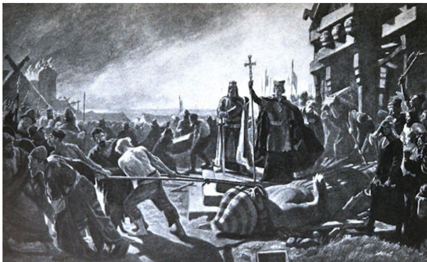
FALL OF ARCONA. THE IDOL SVANTEVIT DESTROYED

The city was allowed to surrender and the people were spared, but Svantevit and his temple were destroyed. A great crowd of his followers had gathered to see him crush his enemies at the last, and Absalon cautioned the men who cut the idol down to be careful that he did not fall on them and so seem to justify their hopes. "He fell with so great a noise that it was a wonder," says Saxo, naïvely; "and in the same moment the fiend ran out of the temple in a black shape with such speed that no eye could follow him or see where he went." Svantevit was dragged out of the town and chopped into bits. That night he fed the fires of the camp. So fickle is popular favor that when the crowd saw that nothing happened, they spurned the god loudly before whom they had grovelled in the dust till then.