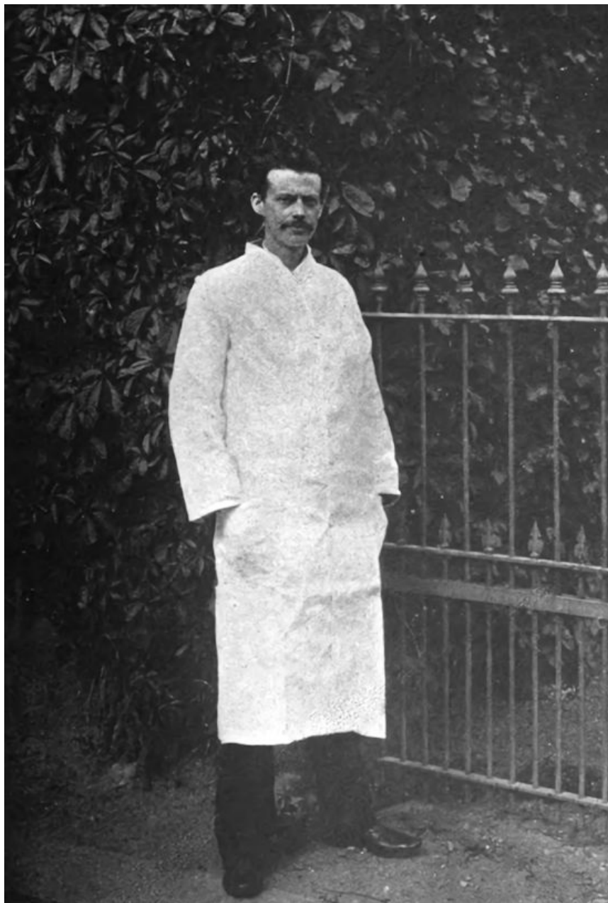
DR. NIELS FINSEN

In the yard of Regentsen there grows a famous old linden tree. Standing at his window one day and watching its young leaf sprout, Finsen saw a cat sunning itself on the pavement. The shadow of the house was just behind it and presently crept up on pussy who got up, stretched herself, and moved into the sunlight. In a little while the shadow overtook her there, and pussy moved once more. Finsen watched the shadow rout her out again and again. It was clear that the cat liked the sunlight.