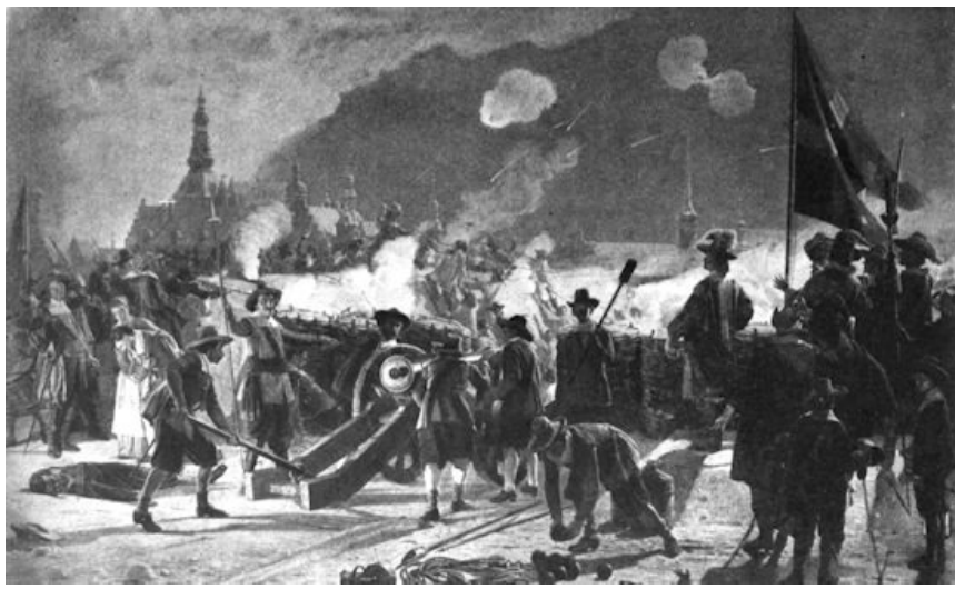
From a painting by Lund