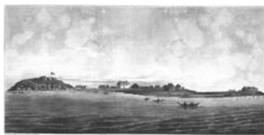
[Illustration: ISLAND OF GOREE ]

The following morning the bride issues forth, with solemn pace and slow, in grand procession, preceded by her most intimate female associate during her virgin state, reclining upon her shoulder with both hands; who, in consequence, is considered as the next matrimonial candidate. They are immediately surrounded by a concourse of attendants, accompanied by music, dancing, and other wild expressions of joy; and in a body proceed to visit her circle of acquaintance and friends, who are always expected to contribute some offering of congratulation. This ceremony is the concluding one on the part of the bride; while the dancing and music are continued by the attendants as long as they can procure any thing either to eat or drink.