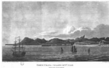
[Illustration: PORTO PRAYA, ISLAND OF ST JAGO ]