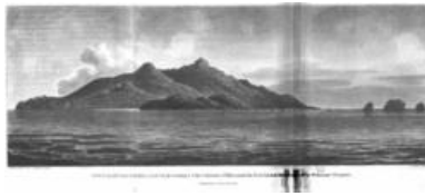
[Illustration: THE COLONY of SIERRA LEONE A bearing S.W. by E. distant 3 MILES, and the BANANAS bearing S.W. by W distant 3 leagues. Published Aug 1 1807 by G & W Nicol]