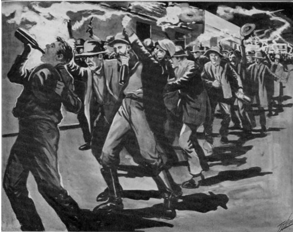
Half a thousand jobless workers, armed and reckless, marched toward the docks. They bore torches.... "A hell-bent crew," said Ellis.

Now half a thousand jobless workers, armed and reckless, marched toward the docks. They bore torches, which illuminated fitfully their flushed, impassioned faces. Here and there one carried a transparency described, "The Chinese Must Go."