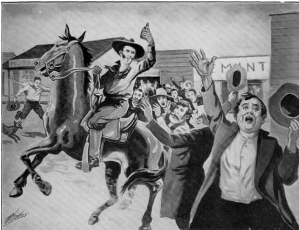
Samuel Brannan rode through the streets, holding a pint flask of gold-dust in one hand ... and whooping like a madman: "Gold! Gold! Gold! From the American River!"