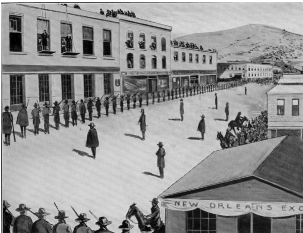
In front of the building on a high platform, two men stood.... A half suppressed roar went up from the throng.

Ned McGowan, made of different stuff, arch plotter, thought by many to be the instigator of King's murder, went into hiding.