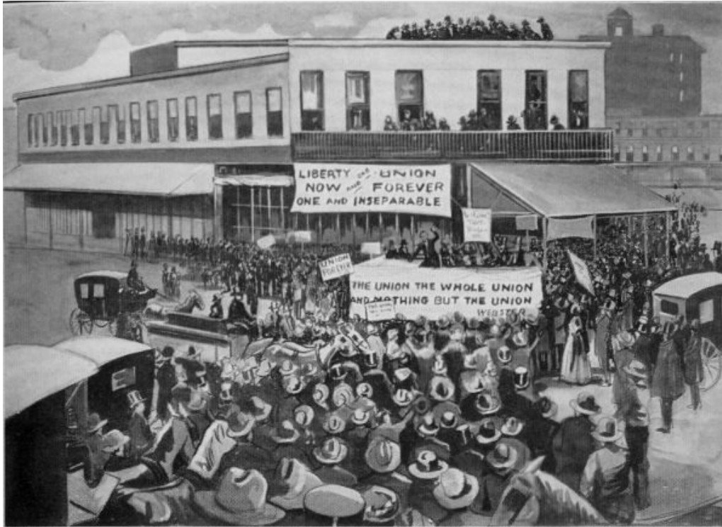
The concourse broke into applause. Then it was hysteria, pandemonium. Fifty thousand knew their city was safe for Anti-Slavery.

At the close there was a little pause, so deep the concentration of their listening, before the concourse broke into applause. Then it was hysteria, pandemonium. Hats flew in the air; whistles, cheers and bravos mingled. The striking of palm against palm was like a great volley. Again and again the preacher rose, bowed, retired. Finally he thanked them, called the meeting closed, and bade them a good afternoon. Only then the crowd began to melt. Fifty thousand people knew their city--and their State no doubt--were safe for anti-slavery.