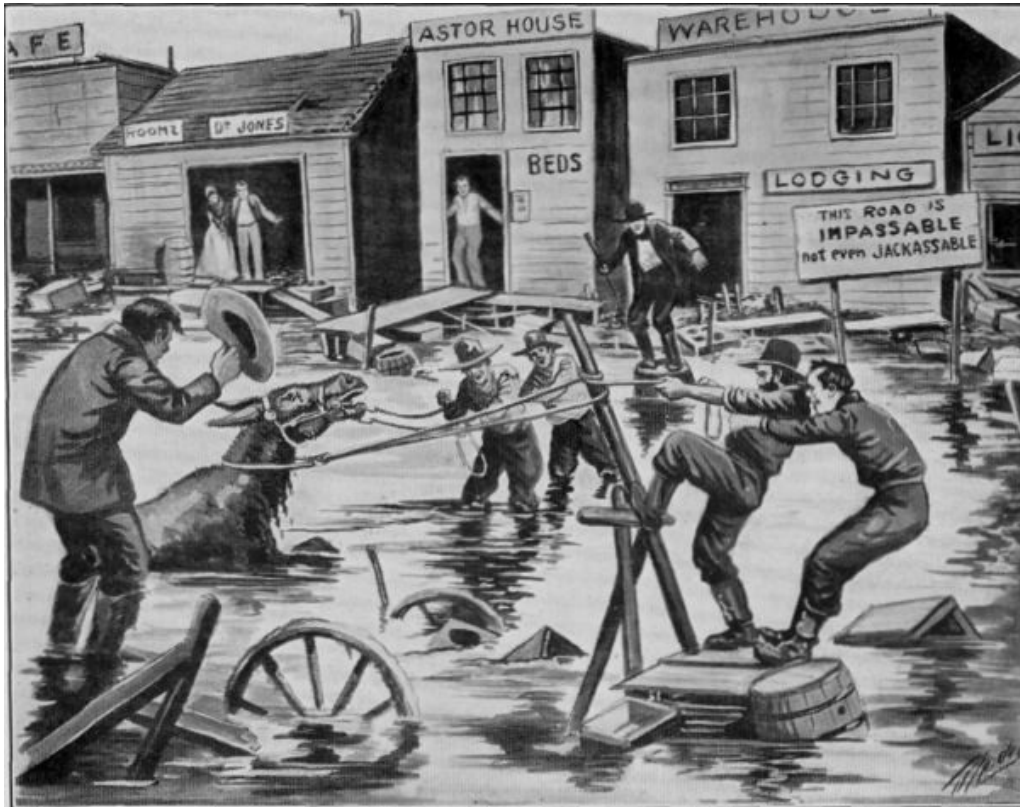
Passersby who laughed at the inscription witnessed simultaneously the rescue of an almost-submerged donkey by means of an improvised derrick.

But Alice was a practical little body. "They'll be hungry when they come home," she averred. "Let us hurry back and get their dinner ready."