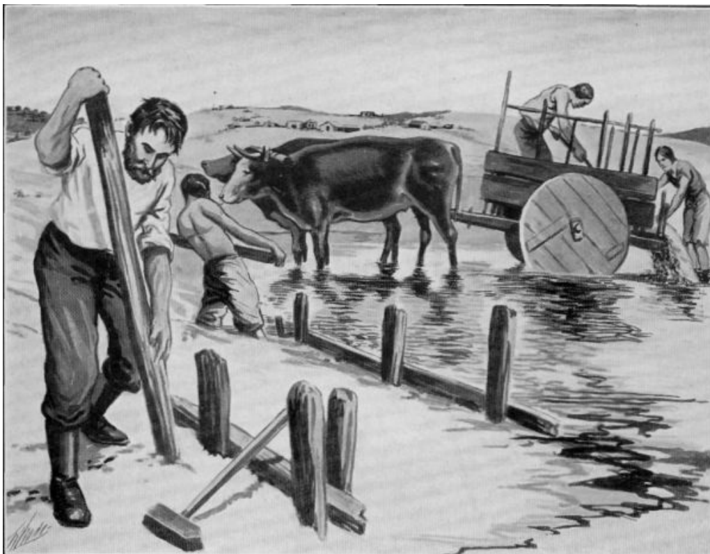
Men with shovels, leveling the sand-hills, piled the wagons high with shimmering grains which were ... dumped into pile-surrounded bogs. San Francisco reached farther and farther out into the bay.

"Oh, those will soon be provided," he assured, "When there is a will for law the machinery comes." He smiled grimly. "McTurpin and his ilk had better look to themselves.... We are going after the gamblers."