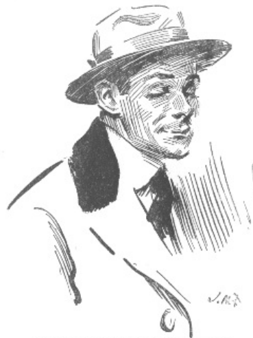
"'Well, raw-thah!' he drawled"—Page 45

Jock McChesney laughed a little, pleased, conscious laugh. "Well, raw-thah!" he drawled, and opened the door leading into the main office. He had been loath to lose one crumb of the savor of it.