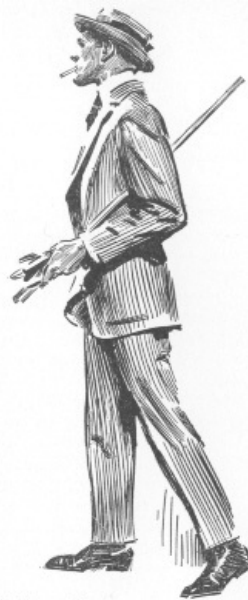
"Jock McChesney began to carry a yellow walking-stick down to work"—Page 58

"Thank fortune!" Mrs. McChesney often said, "that I wasn't cursed with a life of ease. These massage-at-ten-fitting-at-eleven-bridge-at-one women always look such hags at thirty-five."