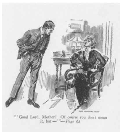
"Good Lord, Mother! Of course you don't mean it, but—"—Page 62

"Mean it! Cleverer women than I have been driven by their children to marrying bell-boys in self-defense. I warn you!"