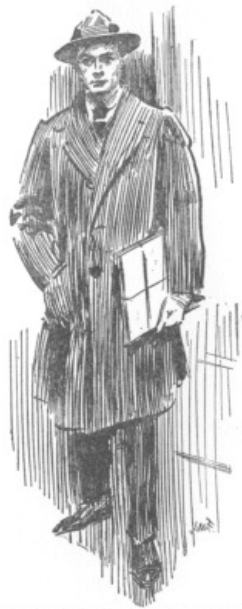
"He made straight for the main desk with its battalion of clerks"—Page 119

"Mr. Griebler in? Mr. Ben Griebler, St. Louis?"