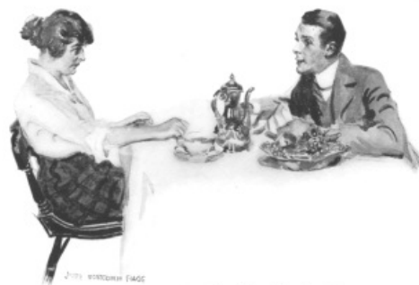
"'You're a jealous blond,' he said"—Page 8

Jock leaned over the table, with his charming smile. "You're a jealous blonde," he laughed. "Because I'm going to be a captain of finance—an advertising wizard; you're afraid I'll grab the glory all away from you."