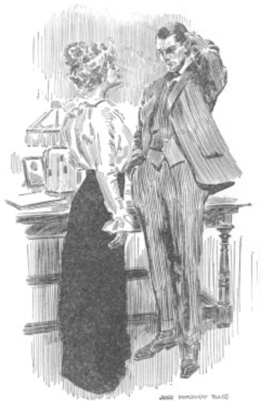
"She laid one hand very lightly on his arm and looked up into the sullen, angry young face"—Page 103

"I've seen older men than you are, Jock, and better men, and bigger men, wearing that same look, and for the same reason. Every ambitious man or woman in business wears it at one time or another. Sooner or later, Jock, you'll have your chance at the money end of this game. If you don't care about the thing you call ethics, it'll be sooner. If you do care, it will be later. It rests with you, but it's bound to come, because you've got the stuff in you."