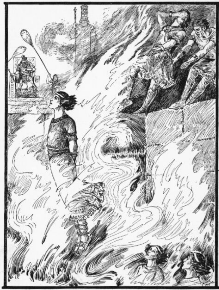
The ascending flames became doubly fierce.

While all is still and solemn, behold, arm in arm, the forms of Shadrach, Meshach, and Abednego! A heavenly smile rests on their countenances. Already they have reached the top, and they stand in the presence of the wondering thousands. For a moment they cast a