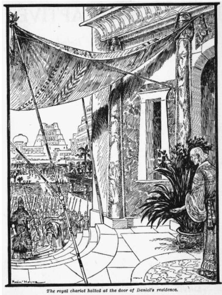
The royal chariot halted at the door of Daniel's residence.

*** START OF THE PROJECT GUTENBERG EBOOK THE YOUNG CAPTIVES: A STORY OF JUDAH AND BABYLON ***