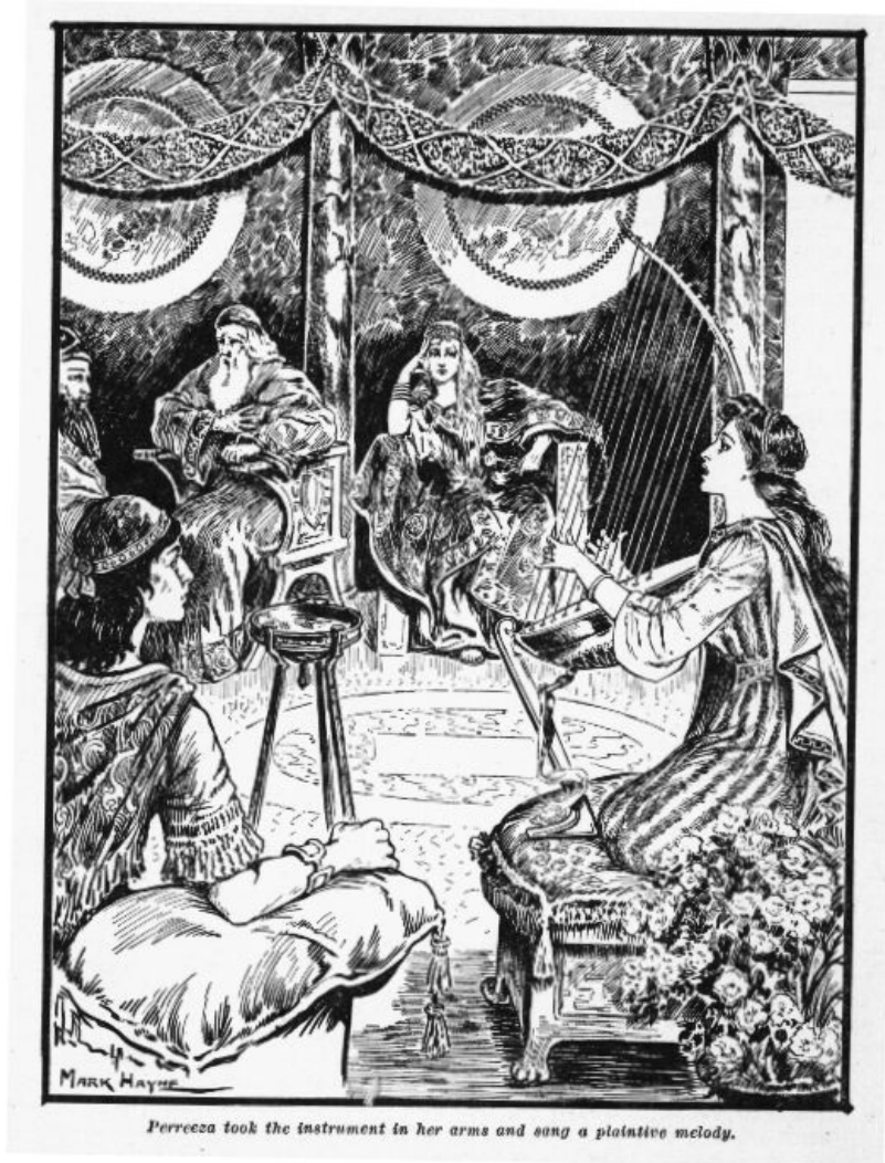
Perreeza took the instrument in her arms and sang a plaintive melody.

"In the first place, then, let me inform you that I am a Hebrew. I was born of noble and wealthy parents who lived within the metropolis of Judah. I was the pride of my father, and by my mother I was almost idolized. Being of a lively temperament I was fond of company and overfond of amusements. I was sent to