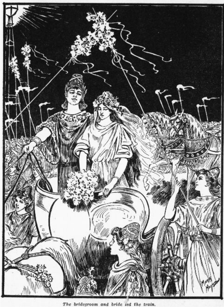
The bridegroom and bride led the train.