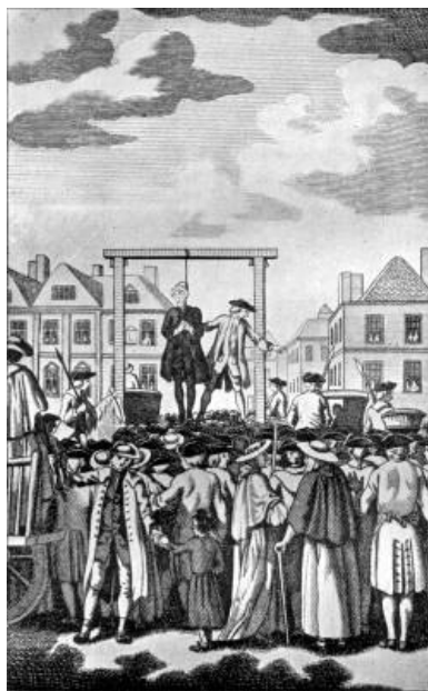
AN EXECUTION IN SMITHFIELD MARKET (From the Newgate Calendar )