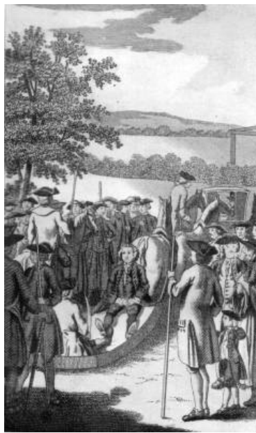
A CONDEMNED MAN DRAWN ON A SLEDGE TO TYBURN (From the Newgate Calendar )