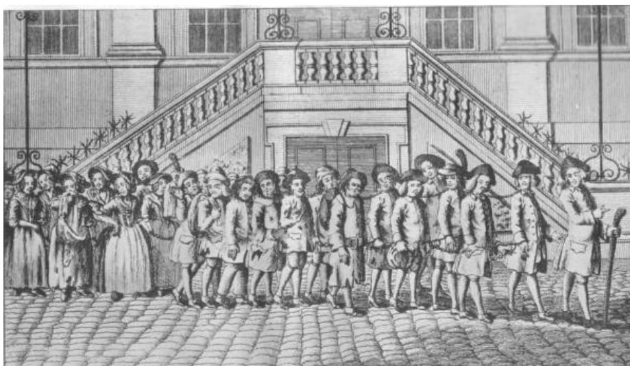
A GANG OF MEN AND WOMEN TRANSPORTS BEING MARCHED FROM NEWGATE TO BLACKFRIARS