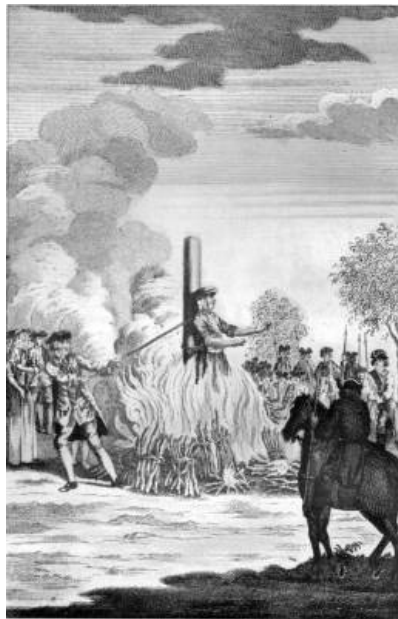
CATHERINE HAYES BURNT FOR THE MURDER OF HER HUSBAND (From the Annals of Newgate )

Notwithstanding the captain owned all this, yet he could not forbear reflections on those who gave testimony against him at his trial, charging them with perjury and conspiracy to ruin him, though nothing like it appeared from the manner in which they delivered their testimony. As the time of his death approached nearer, the fear thereof, and remorse of conscience, brought the captain into so weak and low a state that he could scarce speak or attend to any discourses of others, but lay in a languishing condition, often fainting, and in fine appearing not unlike a person who had taken something to produce a sudden death, in order to prevent an ignominious one. Yet when such suspicions were mentioned to him, he declared that they were without ground, that he had never suffered such a thought once to enter into his head. His wife, who attended him constantly while in prison, said she loved him too well to become his executioner, and that she was positive since his commitment, he had had nothing unwholesome administered to him.