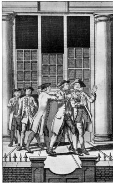
JOSEPH BLAKE ATTEMPTING THE LIFE OF JONATHAN WILD (From the Newgate Calendar )