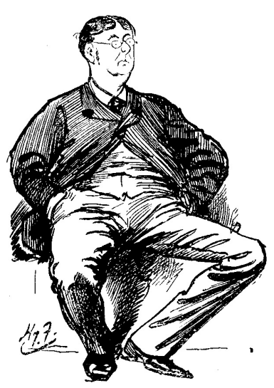
"Amazed at his own Moderation."