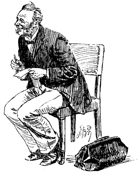
"Your Visitor has his Note-book out."

He is gone, leaving you to wait for the proof, and the photographer, and the appearance of that great work. Notable Nonentities of Norwood ,—and it is not at all unlikely that you may have to wait a considerable time.