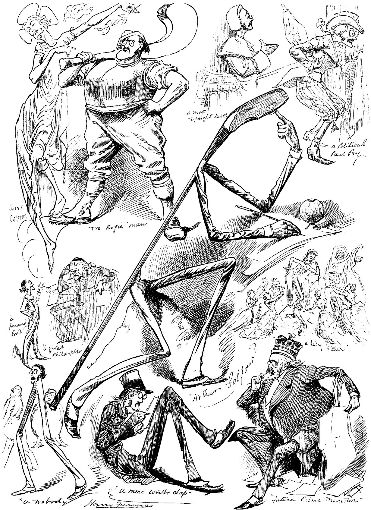
ALL-ROUND POLITICIANS. No. 2.—ARTHUR GOLFOUR.