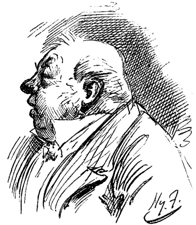
The Inflammable Liquor Bill.