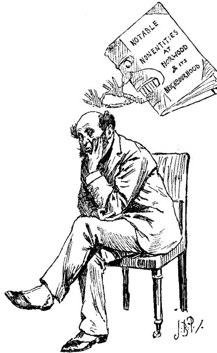
"You may have to wait."