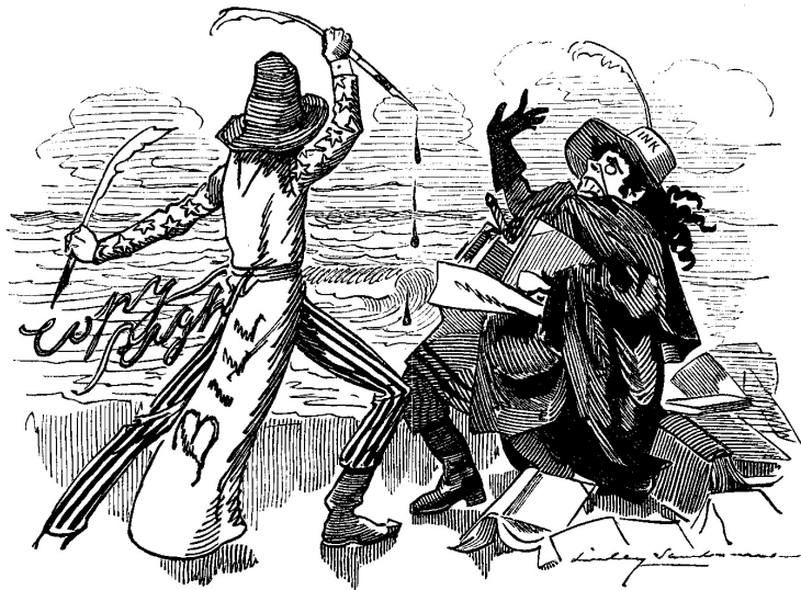
AMERICAN "COPYRIGHT BILL" IN A NEW PART.

RECIPROCITY.—"MACE," in The Illustrated London News , says, sweepingly:—"No Under-Secretary ever has any opinion of his own." Perhaps that is why the Public seldom has any opinion of an Under-Secretary!