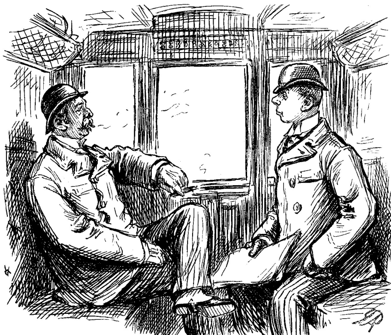
Sylvanus. "FOXES ARE SCARCE IN MY COUNTRY; BUT WE MANAGE IT WITH A DRAG NOW AND THEN!"

[Mutually assist each other to rise and quit the Battle-field, the Military Instructor threatening to write to the "Times," and TOMMY ATKINS still grinning as Curtain falls.