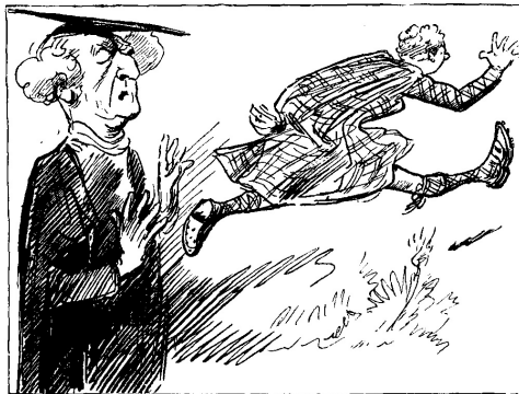
Grand Combination Picture, "Liddell and Scott!" [Liddell (289) by H. Herkomer, R.A., and Scott (281) by G(ee) W(oa) Joy! "Joy and Woe!" Comedy and Tragedy.]