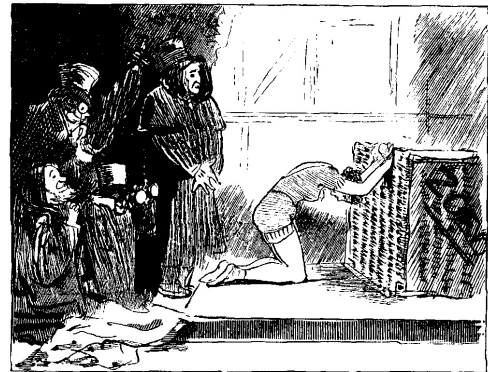
No. 226. The Penance of Zæo in the presence of some Members of the County Council. P.H. Calderon, R.A.

No. 5. " Long Ago ." LONG (EDWIN, R.A.) and more or less of "a go." Instead of " Long Ago " which is egotistical, why not Long Egit or Long Fecit ?