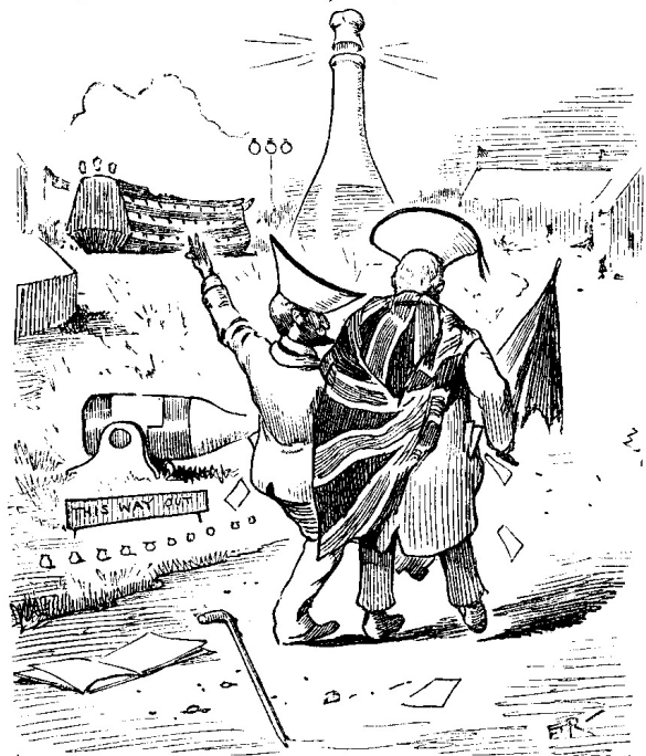
Mr. Punch's Representatives, after partaking of Chelsea Hospitality (a purely fancy sketch).

The Scribe and the Artist, on their visit, were invited by all sorts and conditions of men to partake of champagne. The moment it was discovered that they were "connected with the Press," the offerers of hospitality were absolutely overwhelming. But, obeying the best traditions of their order, they sternly, but courteously, refused all refreshment. It is fortunate they pursued this course, for had they received the entirely disinterested kindness of their would-be hosts, their recollections of the marvels of the Royal Naval Exhibition would no doubt have been of the haziest character imaginable. As it was, they were able to take their departure through the main entrance with some show of dignity, and not in a less imposing manner (as the Committee— Cook's Gallery near the Dining-rooms—ho! ho! ho! ha! ha! ha!—would probably and amusingly suggest), by Tite Street.