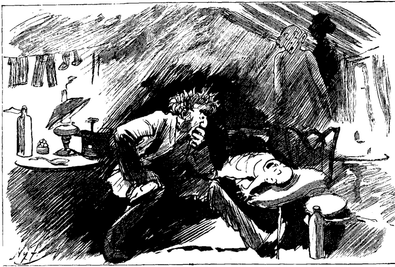
No. 199. Doctor Dubitans. "I'm afraid I've given him the wrong stuff." Luke Fildes, R.A.