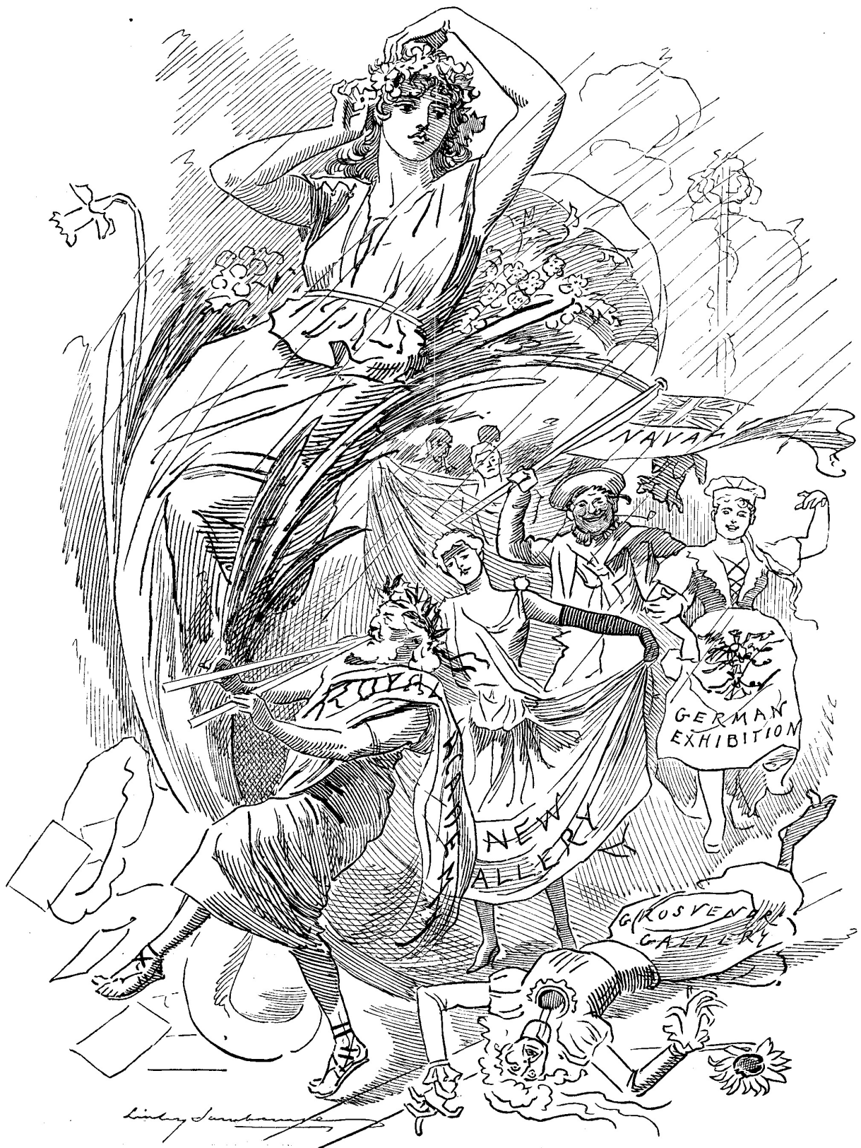
FASHION'S FLORALIA: OR, THE URBAN QUEEN OF THE MAY.