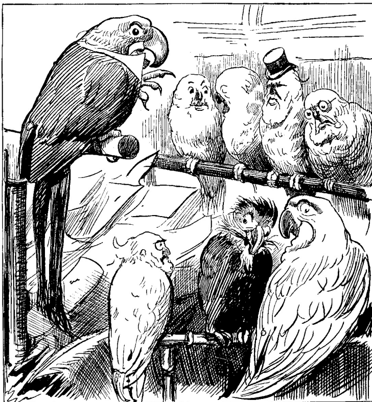
No. 259. "A Select Committee." H. Stacy Marks, R.A.

No. 278. " The Fleecy Charge ." A title that suggests an attempt at extortion, but is here applied to A picture in wool-work by the veteran, T. SYDNEY COOPER, R.A. Of course whatever the artist may ask for it, it will always be "sheep at the price."