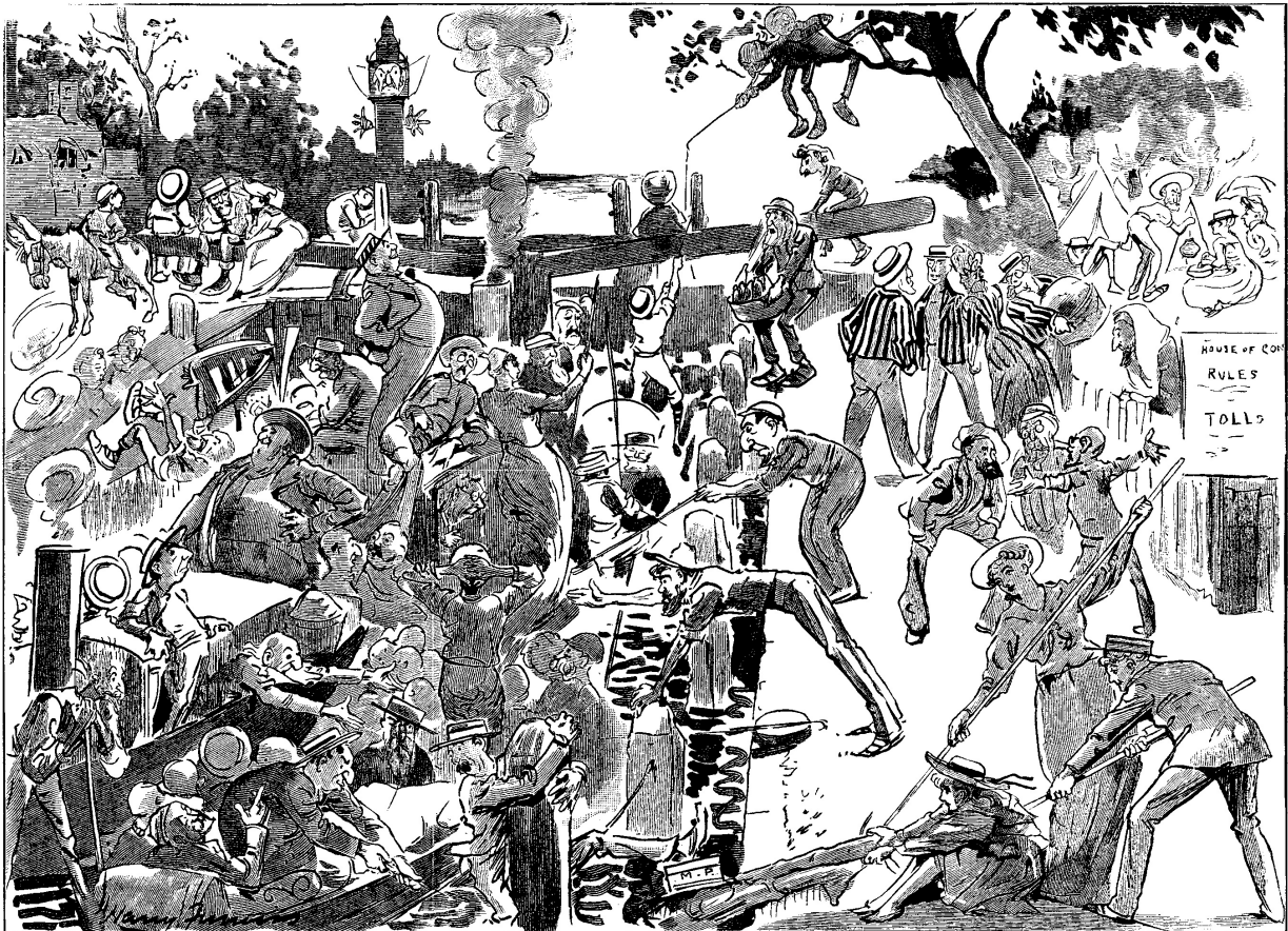
POLITICAL BOATING-PARTY DURING THE RECESS.