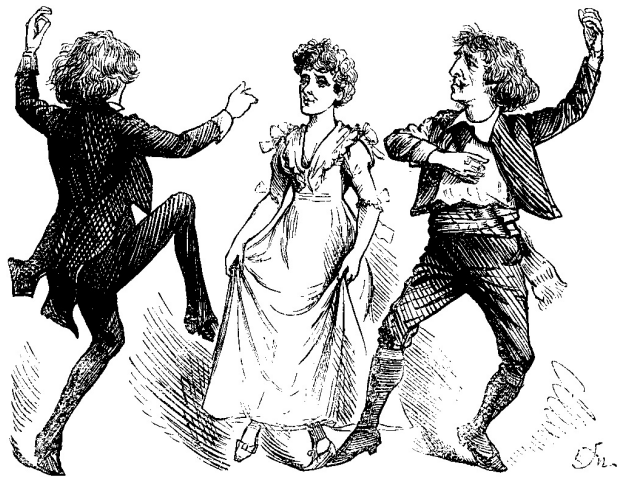
The Corsican Brothers and Nance Oldfield at the Lyceum.

THE EPIDEMIC.—Up to now Members of Parliament have been generally considered as "influential personages." This year many M.P.'s will be remembered as "very influenzial personages."