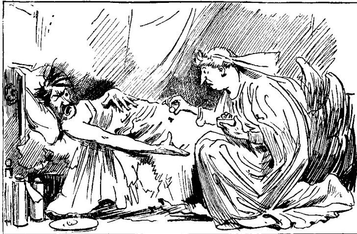
No. 164. Pilling Him. Affectionate wife insisting on the invalid taking a Bolus. Sidney Paget.