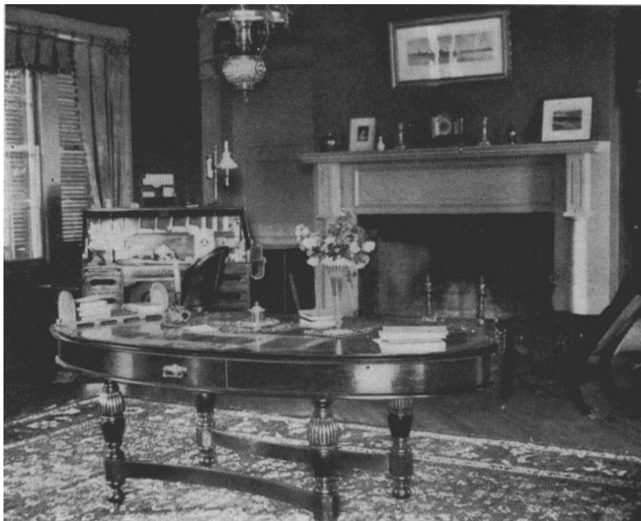
A CORNER IN MR. STOCKTON'S STUDY AT CLAYMONT. Showing the desk at which all his later books were written.

Mr. Stockton was permitted to enjoy this beautiful place only three years. They were years of such rare pleasure, however, that we can rejoice that he had so much joy crowded into so short a space of his life, and that he had it at its close. Truly life was never sweeter to him than at its end, and the world was never brighter to him than when he shut his eyes upon it. He was returning from a winter in New York to his beloved Claymont, in good health, and full of plans for the summer and for his garden, when he was taken suddenly ill in Washington, and died three days later, on April 20, 1902, a few weeks after Kate Bonnet was published in book form.