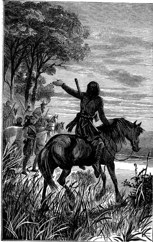
"We halted on the bank of a small river."

Long before morn the Indian scout guided us to three miles westward, behind a swell of the prairie. It was an excellent precaution, which prevented any Umbiqua straggler from perceiving us, a rather disagreeable event, which would have undoubtedly happened, as we were camped only two miles from them, and the prairie was flat until you came to the swell just mentioned. There we beheld seven strong horses, bridled with our lassoes. We had no saddles; but necessity rides without one. The Indians had also killed a one-year-old colt, and taken enough of the meat to last us two days; so that when we started (and we did so long before the Umbiquas began to stir) we had the prospect of reaching the fishing-post thirty hours before them.