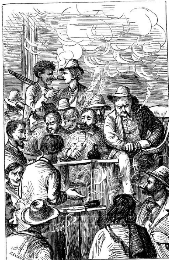
"The attorney, on his legs, addressing the jury, was also smoking."

The judge was seated upon a chair, the frame of which he was whittling with such earnestness that he appeared to have quite forgotten where he was. On each side of him were half a dozen of jurymen, squatted upon square blocks, which they were also whittling, judge and jurymen having each a cigar in the mouth, and a flask of liquor, with which now and then they regaled themselves. The attorney, on his legs, addressing the jury, was also smoking, as well as the plaintiff, the defendant, and all the audience. The last were seated, horseback-fashion, upon parallel low benches, for their accommodation, twenty feet long, all turned towards the judge, and looking over the shoulders of the one in front of him, and busily employed in carving at the bench between his thigh and that of his neighbour. It was a very singular coup d'oeil , and a new-comer from Europe would have supposed the assembly to have been a "whittling club."