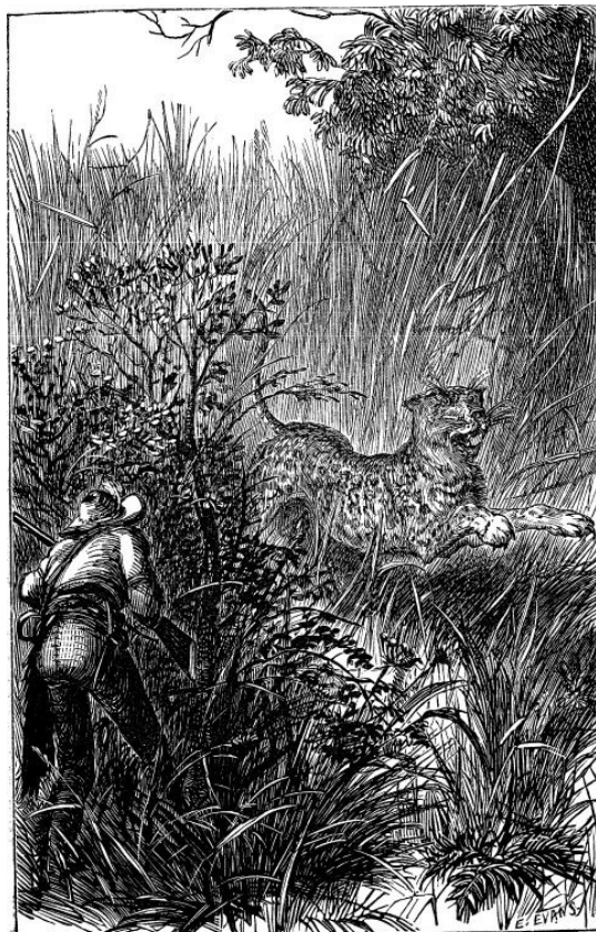
"With a long and light spring it broke out of the canes."

When I approached, all the dogs were upon the animal, except a fierce little black bitch, generally the leader of the pack; I saw her dart through the canes with her nose on the ground, and her tail hanging low. The panther was a female, very lean, and of the largest size; by her dugs I knew she had a cub which could not be far off, and I tried to induce the pack to follow the bitch, but they were all too busy in tearing and drinking the blood of the victim, and it was not safe to use force with them. For at least ten minutes I stood contemplating them, waiting till they would be tired. All at once I heard a bark, a growl, and a plaintive moan. I thought at first that the cub had been discovered, but as the dogs started at full speed, following the chase for more than twenty minutes, I soon became convinced that it must be some new game, either a boar or a bear. I followed, but had not gone fifty steps, when a powerful rushing through the canes made me aware that the animal pursued had turned back on its trail, and, twenty yards before me, I perceived the black bitch dead and horribly mangled. I was going up to her, when the rushing came nearer and nearer; I had just time to throw myself behind a small patch of briars, before another panther burst out from the cane-brakes.