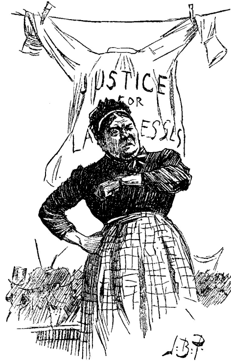
"I've been and spoke to hover forty Members o' Parlyment myself!"

[ She stands down, having made the speech of the afternoon, and is rewarded by approving cries of "Good old girl!" An employer of labour is next introduced, and received at first with suspicion, until he explains that he is heart and soul with them, that he does not dread the application of the Factory Acts to his own establishment, and considers that it would be an excellent thing if all the smaller laundries were closed to-morrow, whereupon the ladies habitually employed in these places cheer him heartily.