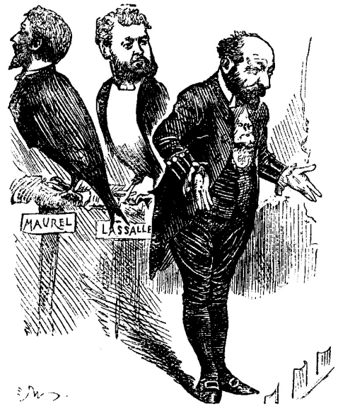
Birds can sing, but wouldn't sing, and couldn't be made to sing, at Covent Garden, Wednesday, July 8.