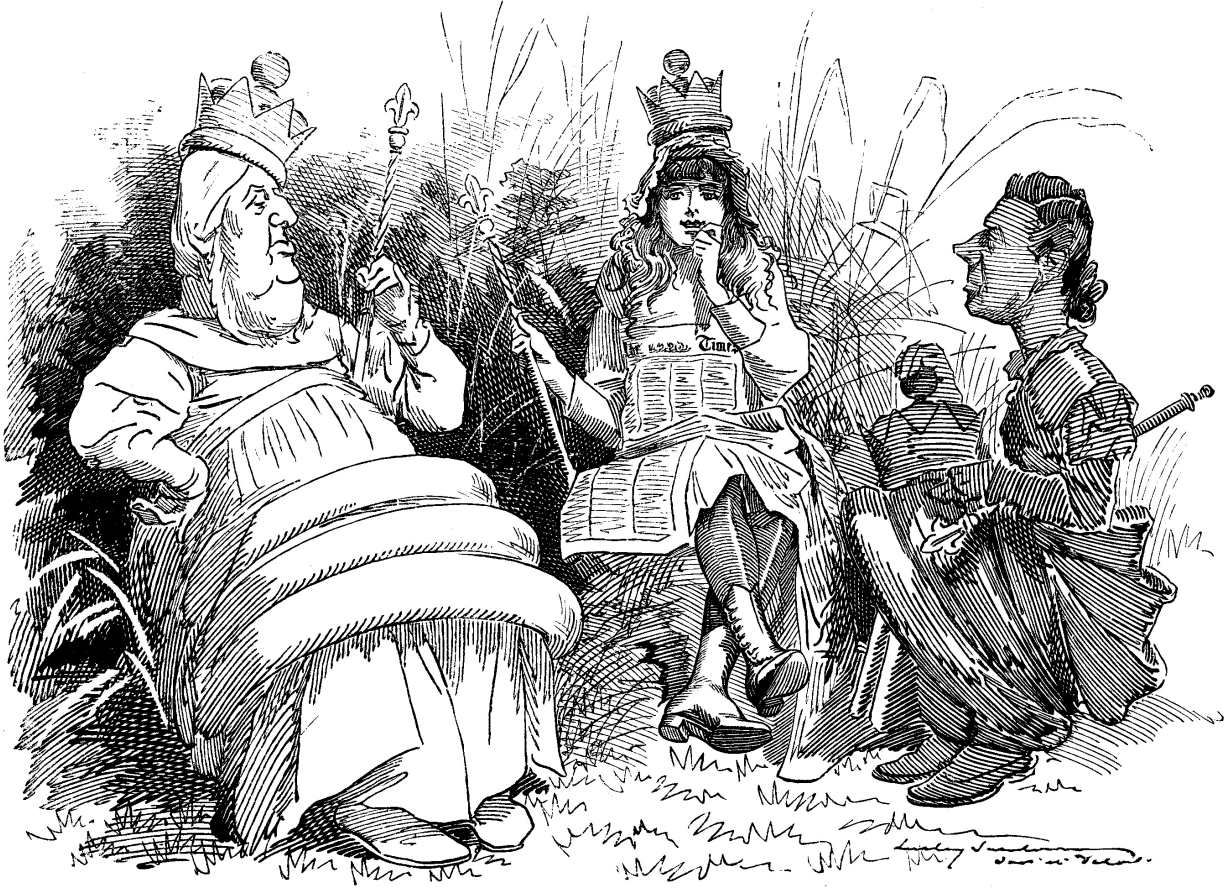
THE RED QUEEN AND THE WHITE; OR, ALICE IN THUNDERLAND.