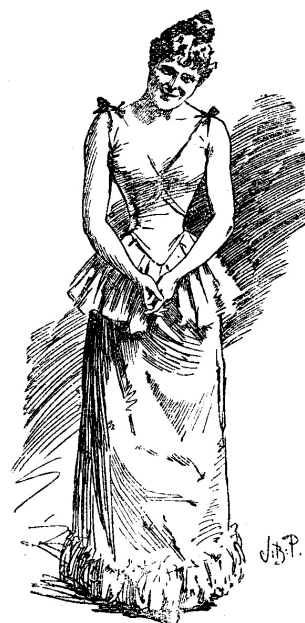
"I am only a Cowboy."

Who would imagine one meek-voiced girl could have held her own, in a deafening din! But LOBELIA's scholars discovered soon she'd a dead-sure notion of discipline;