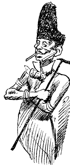
Native Masher from Masherland.