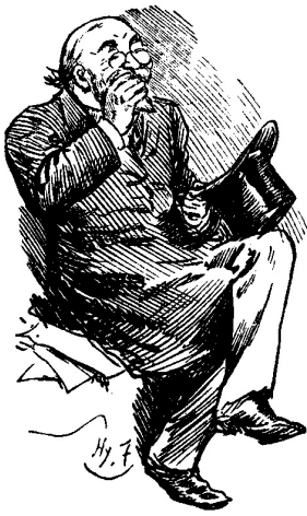
Sage of Queen Anne's Gate.

Business done. —Education Bill through Report Stage.