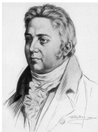
SAMUEL TAYLOR COLERIDGE

Samuel T. Coleridge was a thinker, and thinkers are so rarely found that the world must take note of them. John Stuart Mill, writing in Eighteen Hundred Forty, assigned first place among English philosophers to