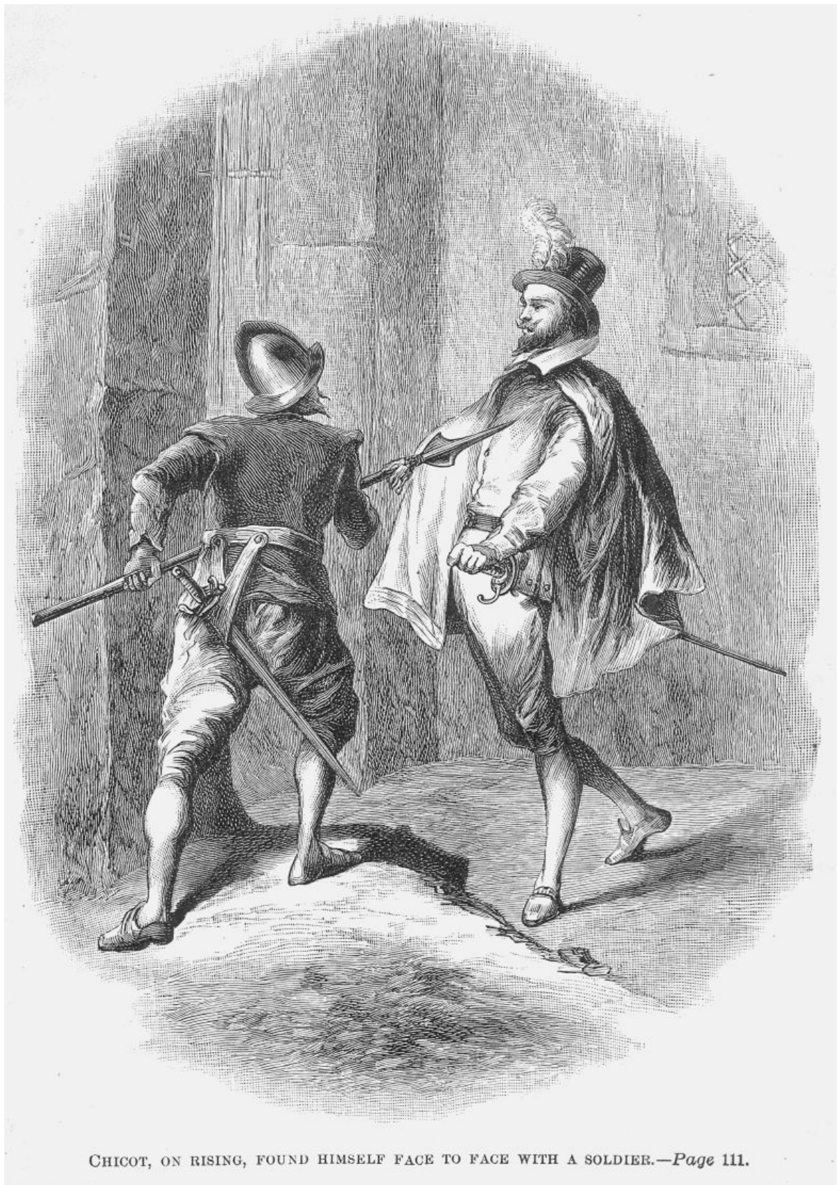
CHICOT, ON RISING, FOUND HIMSELF FACE TO FACE WITH A SOLDIER.—Page 111.

"Ah! mon Dieu! have you hurt yourself, M. Chicot?" said he.