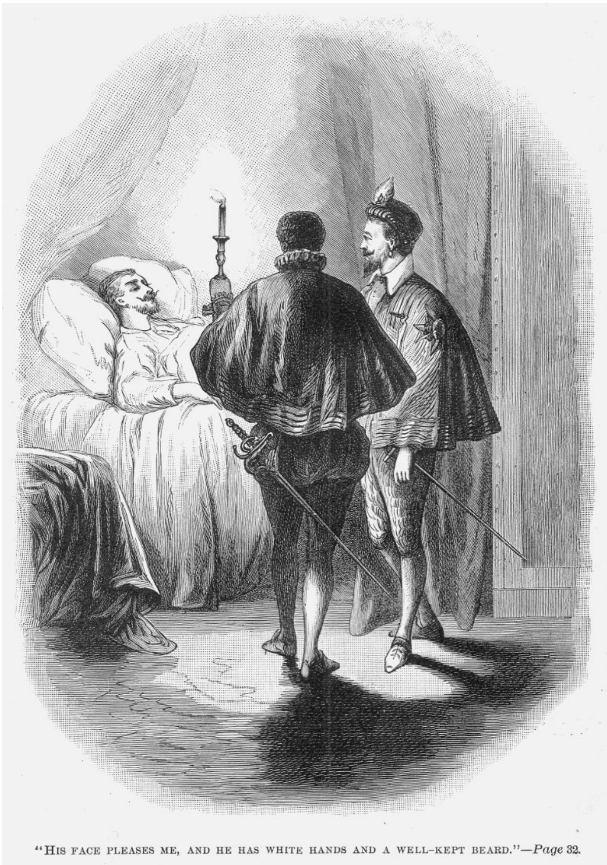
"HIS FACE PLEASURES ME, AND HE HAS WHITE HANDS AND A WELL-KEPT BEARD."—Page 32.

"It is Ernanton de Carmainges, a fine fellow, who is capable of much."