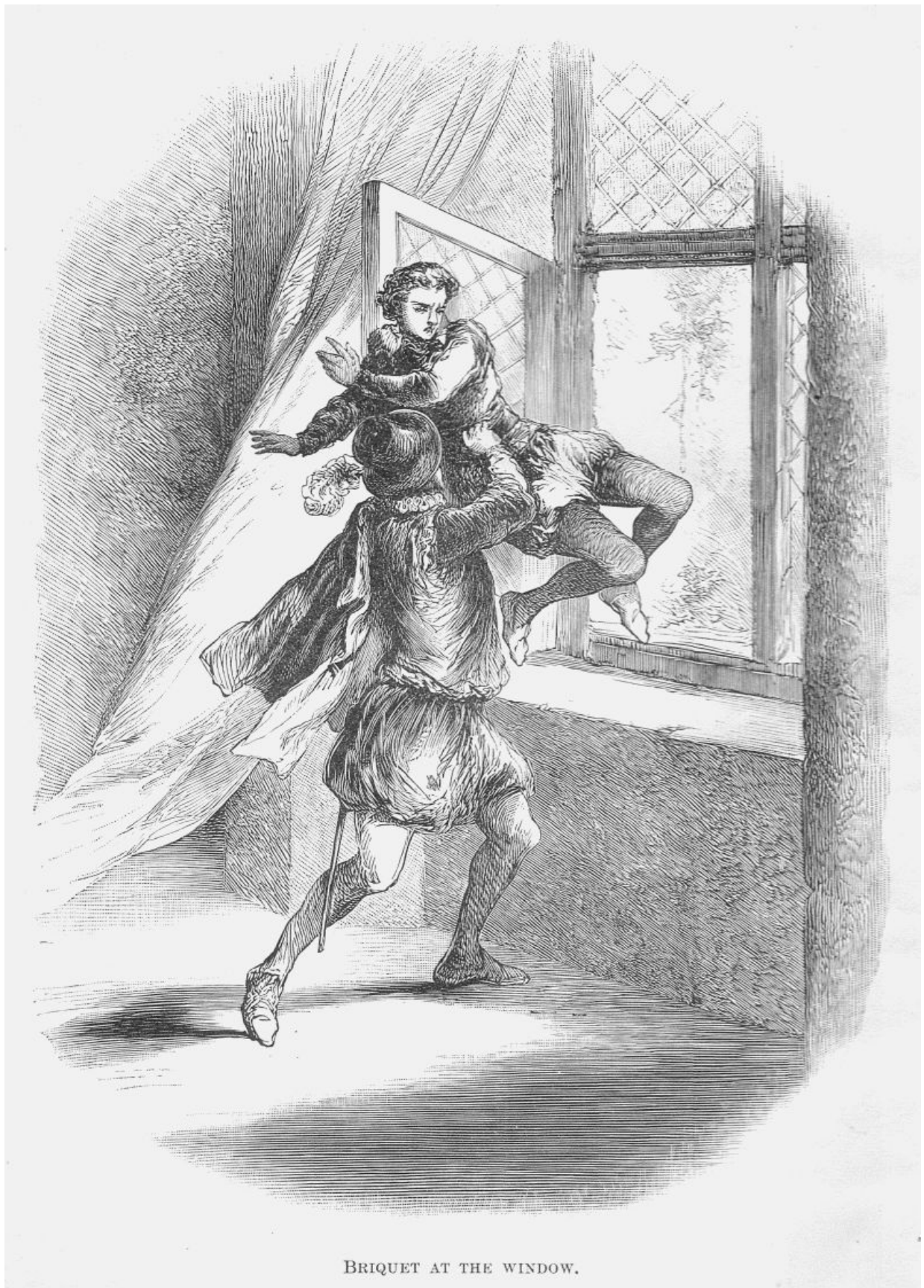
BRIQUET AT THE WINDOW.