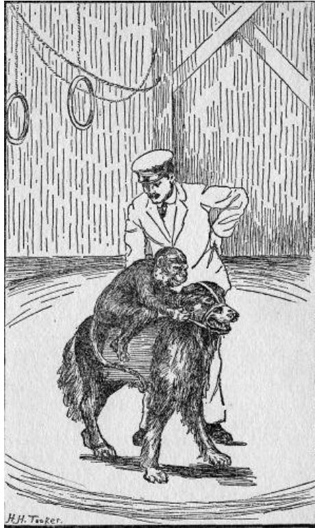
Around and around in a ring went Prince carrying Mappo. (Page 87)

"That's a good idea—I'll do it!" cried Mappo.