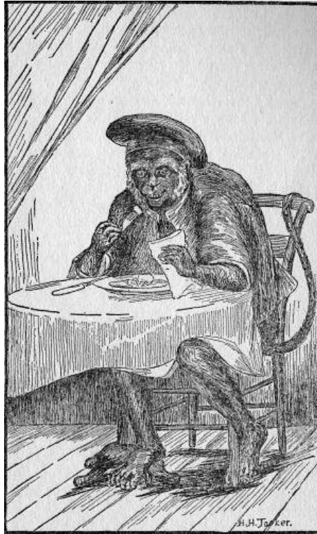
Mappo sat up at the table and eat his dinner with knife, fork and spoon. (Page 119)

Now Mappo knew what a fire was. There used to be a fire in the stove at the big circus barn, and once he went too close and burned his paw.