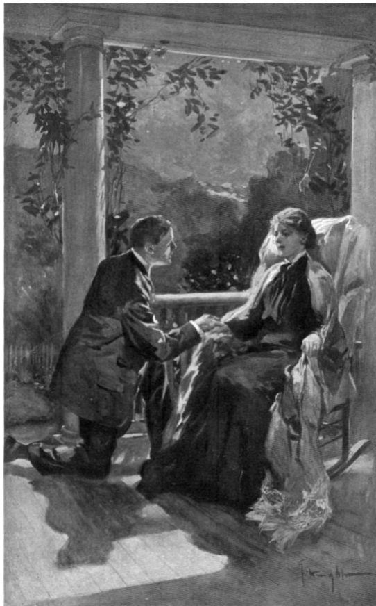
"Lois--I have come"--he began

"My old Doctor--?" she began presently, and looked up at him with eyes "like stars half-quenched in mists of silver dew."