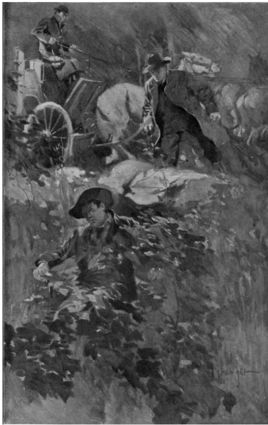
Sprang over the edge of the road into the thick bushes below.

At the same moment Keith disappeared over the wheel. He had fallen or sprung from his seat.