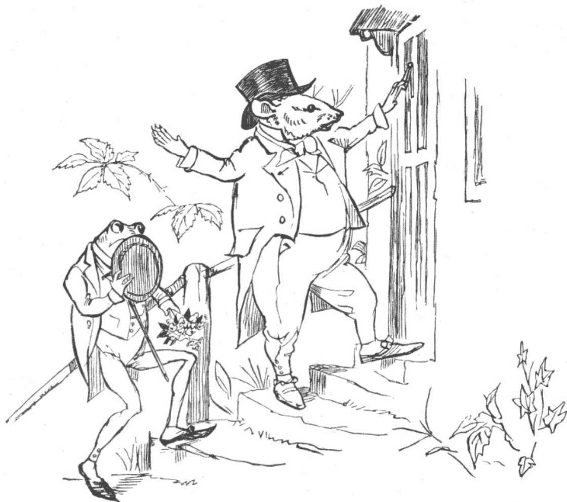
Now they soon arrived at Mousey's Hall,