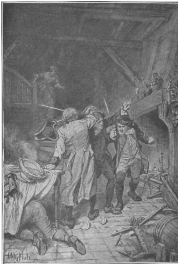
KEEP BACK, DAVIE! ARE YE DAFT?