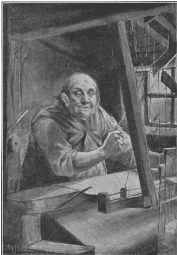
THERE HE SAT, A MUCKLE FAT, WHITE HASH OF A MAN LIKE CREISH

"God be guid to us," says Tam Dale, "this is no canny!"