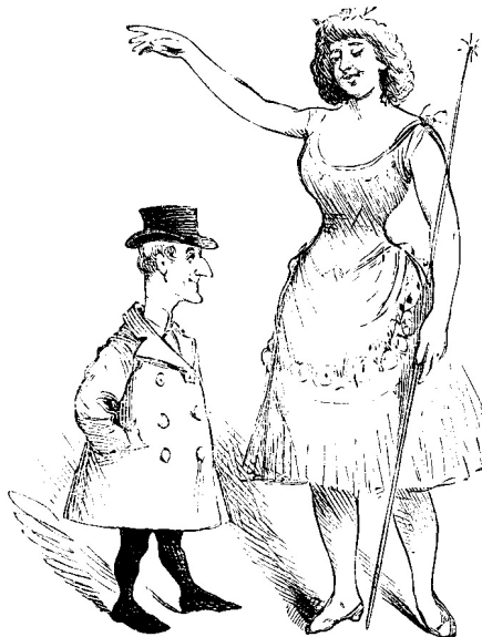
Little Tich and the Fine Fairy.