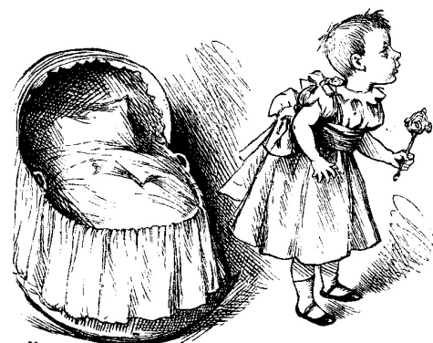
Second Week. Little 1892 grows rapidly, and begins to look about him.

You call him "fine"—he's great in size, And "promising"—there issue from his Tough larynx quite stentorian cries;