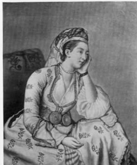
MARIA, COUNTESS OF COVENTRY.

Lady Coventry had no greater admirer of her own charms than herself. She spent her days worshipping at the shrine of her loveliness, and embellished nature with every device of art. She squandered fortunes in adorning it with the most costly jewellery and dresses, of one of which the following story is told. One day she exhibited to George Selwyn a wonderful costume which she was going to wear at an approaching fête. The dress was a miracle of blue silk, richly brocaded with silver spots of the size of a shilling. "And how do you think I shall look in it, Mr Selwyn?" she archly asked. "Why," he replied, "you will look like change for a guinea."