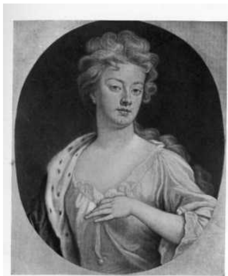
SARAH, DUCHESS OF MARLBOROUGH.