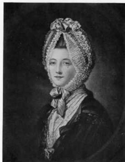
ELIZABETH, DUCHESS OF HAMILTON.