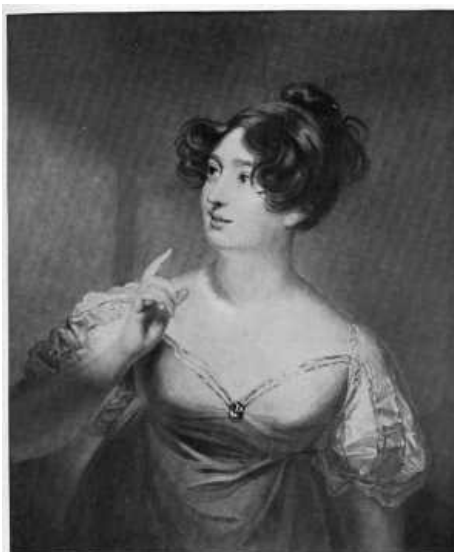
HARRIET, DUCHESS OF ST. ALBANS.

Such were the charms and talent that the child developed that, by the time she came to her eighteenth birthday she was carried off to London to appear at Covent Garden Theatre as Lady Townley in The Provoked Husband ; and the general verdict was that no such clever acting had been seen since Miss Farren was lured from the stage by a coronet. And not only did she create an immediate sensation by her acting; her beauty, which a contemporary writer tells us, "combined the stateliness of Juno with the gentler and beauty of a Venus," made her a Queen of Hearts as of actresses. So seductive a prize was not likely to be long left to adorn the stage; and although Miss Brunton consistently turned a blind eye to many a seductive offer, she had to succumb when his Lordship of Craven joined the queue of her courtiers. Four years of stage sovereignty and then the coronet of a Countess; such was the record of this daughter of a strolling player, whose greatest ambition had been to provide food enough for his hungry family. Lady Craven lived nearly sixty years to enjoy her dignities and splendours, surviving long enough to see her grandson take his place as third Earl of his line.