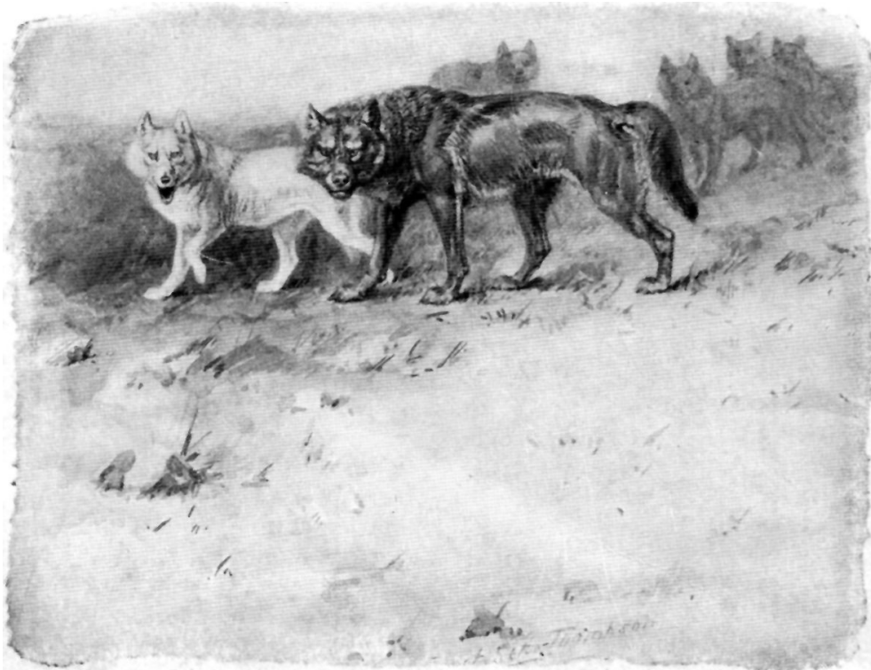
Lobo and Blanca.

and stones with his hind feet till he had sprung every trap. This he did on many other occasions, and although I varied my methods and redoubled my precautions, he was never deceived, his sagacity seemed never at fault, and he might have been pursuing his career of rapine to-day, but for an unfortunate alliance that proved his ruin and added his name to the long list of heroes who, unassailable when alone, have fallen through the indiscretion of a trusted ally.