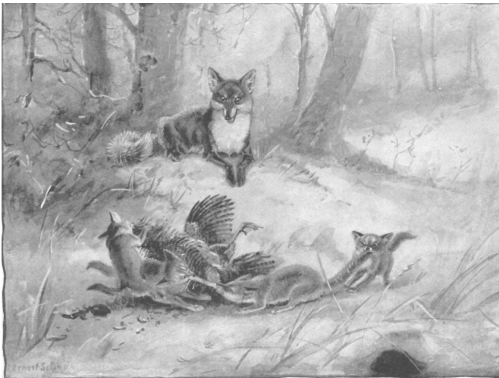
They tussled and fought while their mother looked on with fond delight.

For many days I went there and saw much of the training of the young ones. They early learned to turn to statuettes at any strange sound, and then on hearing it again or finding other cause for fear, to run for shelter.