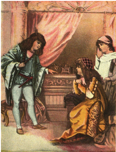
Choosing the Casket

The two Dromios were glad to think they would receive no more beatings.