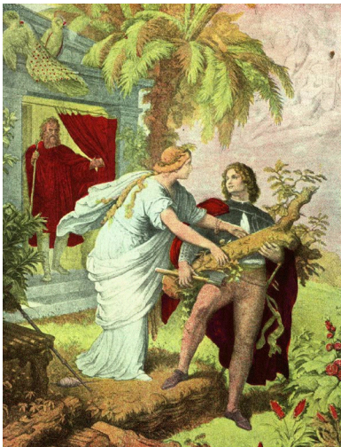
Ferdinand and Miranda

So the four mortal lovers went back to Athens and were married; and the fairy King and Queen live happily together in that very wood at this very day.