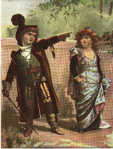
Petruchio and Katherine