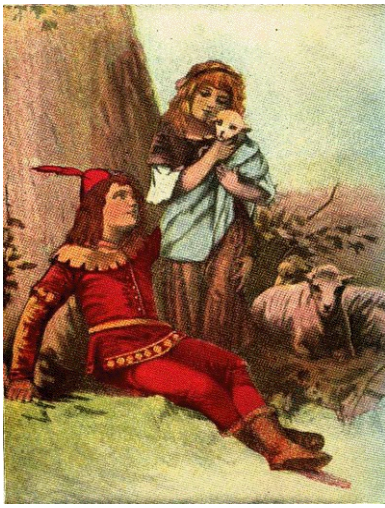
Prince Florizel and Perdita