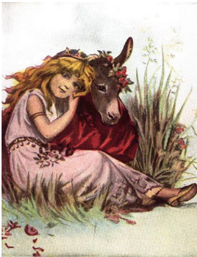
TITANIA AND THE CLOWN

WILLIAM SHAKESPEARE TITANIA AND THE CLOWN FERDINAND AND MIRANDA PRINCE FLORIZEL AND PERDITA ROMEO AND JULIET IMOGEN CHOOSING THE CASKET PETRUCHIO AND KATHERINE