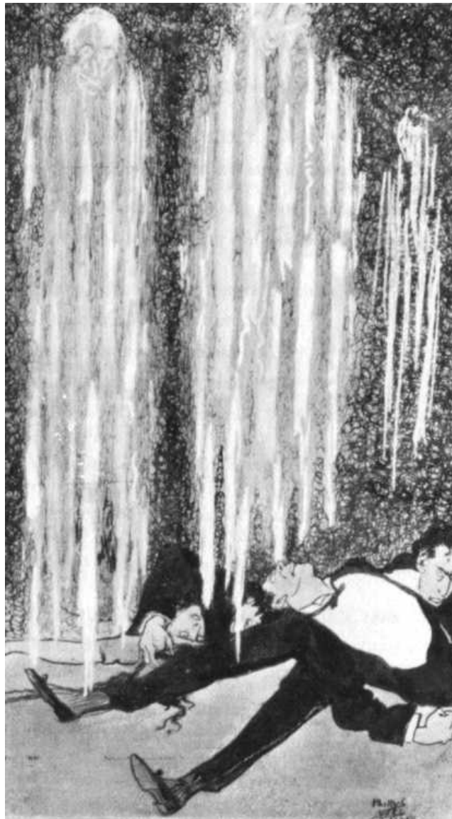
THE ROOM FILLED WITH LUMINOUS, STRIPED FIGURES

"Call for the police, Ed!" Kelson gasped, "the police—or—" But before he could utter another syllable, walls, floor and ceiling shook with loud, devilish laughter. There was then silence—enthraling, impressive, omnipotent silence—the electric light went out—and the room filled with luminous, striped figures.