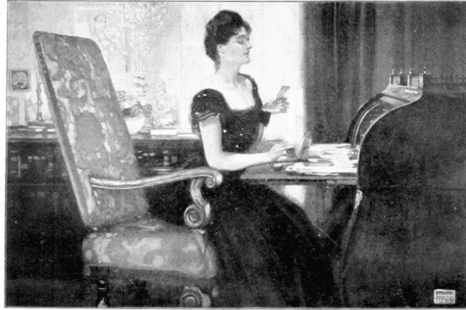
DIANE PROPPED THE CABLEGRAM IN A CONSPICUOUS PLACE

"Diane," she asked, dropping among the cushions of a divan, "are you going to marry father?"