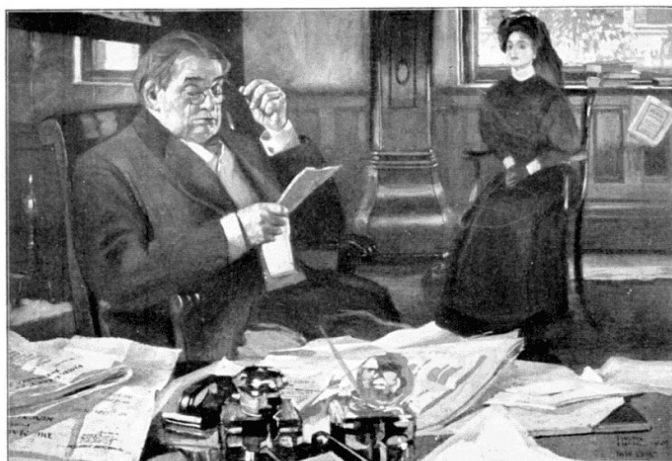
THE BANKER TOOK A LONGER TIME THAN WAS NECESSARY TO SCAN THE POOR LITTLE LIST

"Here's the memorandum. They said they were mostly bonds, and very good ones."