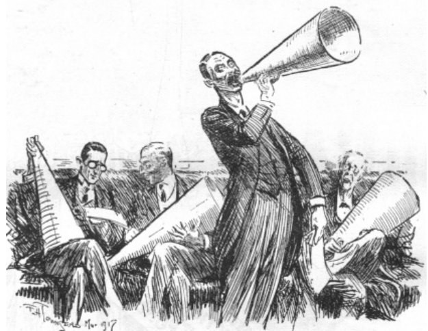
MEGAPHONES FOR MINISTERS. A SUGGESTION FROM THE PRESS GALLERY.

Thursday, March 15th. —Under the present rules of procedure (the products of Irish obstruction in the past) the Nationalists find it difficult to put their declaration of war against the Government to much effect. Their best chance comes during the first hour of the sitting, and their most useful weapon is the Supplementary Question. No sooner has Mr. DUKE read the official reply to the inquiry on the Paper than there comes a strident "Arising out of that, Mr. SPEAKER-R." Fortunately the CHIEF SECRETARY possesses a Job-like patience, and is rarely betrayed into any departure from his polite if somewhat ponderous manner. To badger Mr. BIRRELL was an exciting pastime rather like punching the ball. To heckle Mr. DUKE is like hammering a sandbag.