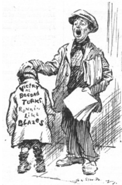
THE NEW POSTER.

Ho Lor, it isn't a dream, It's just as it used to be, every bit; Same old whistle and same old bang And me out again to be 'it. A.A.M.