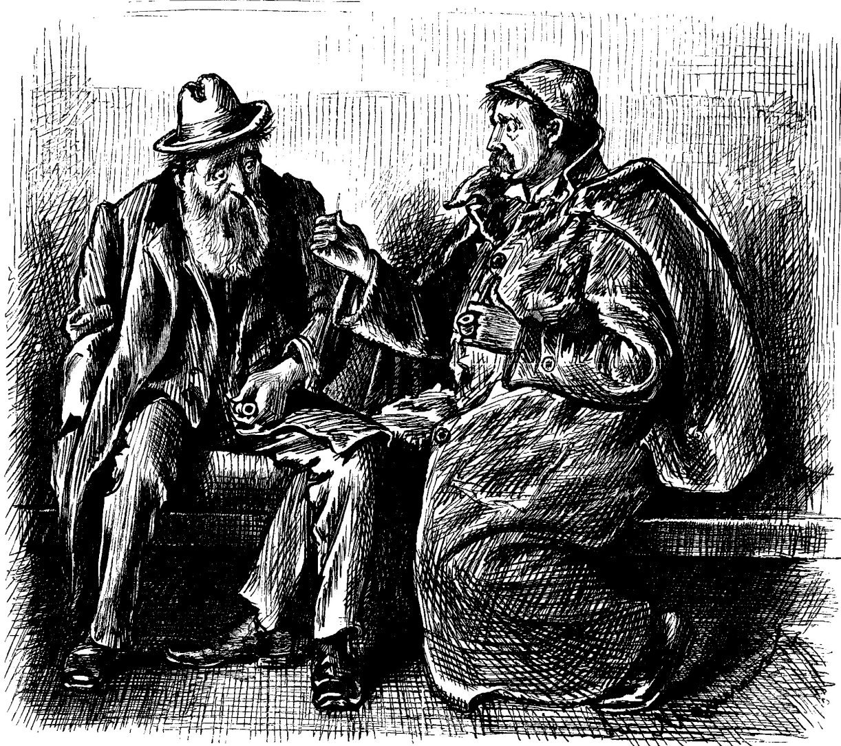
A TRAGEDY ON THE GREAT NORTHERN.