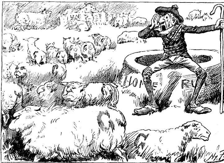
Mr. G. dreams a Dream.