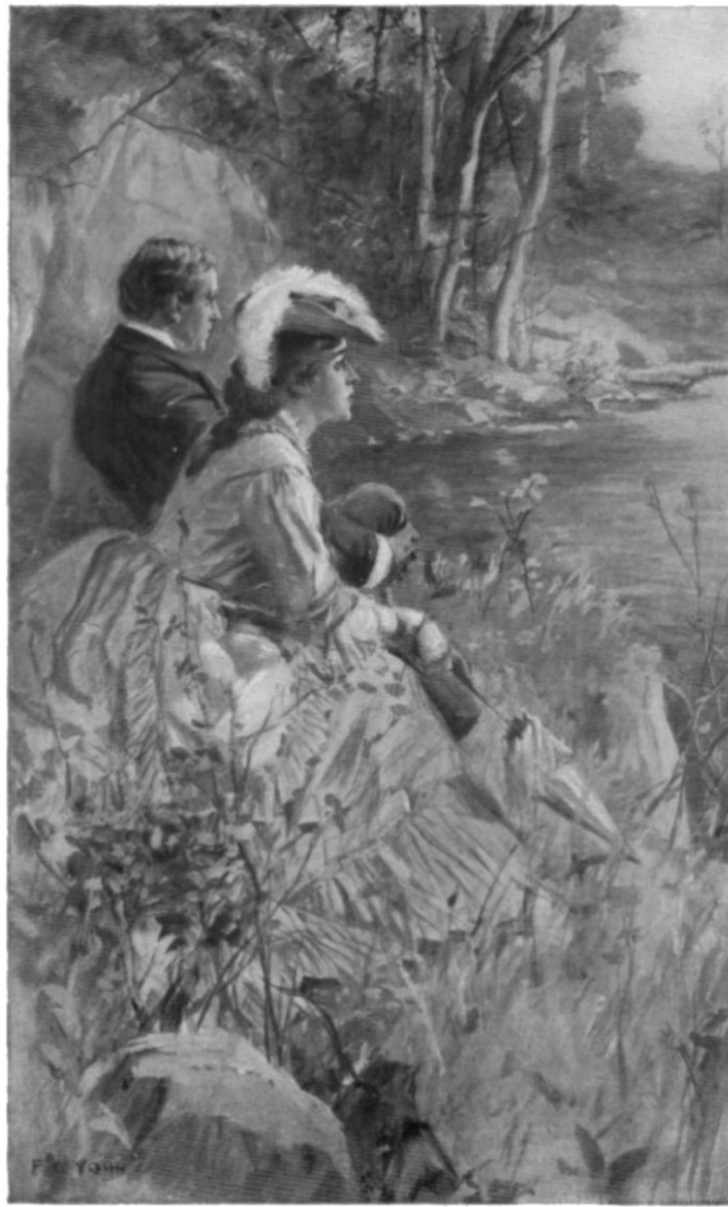
"Indeed it was clear that to go away would be unfair."

Indeed, it was clear that to go away—unless he honestly felt too weak to remain—would be unfair to almost every person, every interest, concerned; and such a step was but second choice in Ruth's mind, conditioned solely on any unreadiness he might have uprightly to bear the burden brought upon him by—well, after all, by his own too confident miscalculations in the game of hearts.