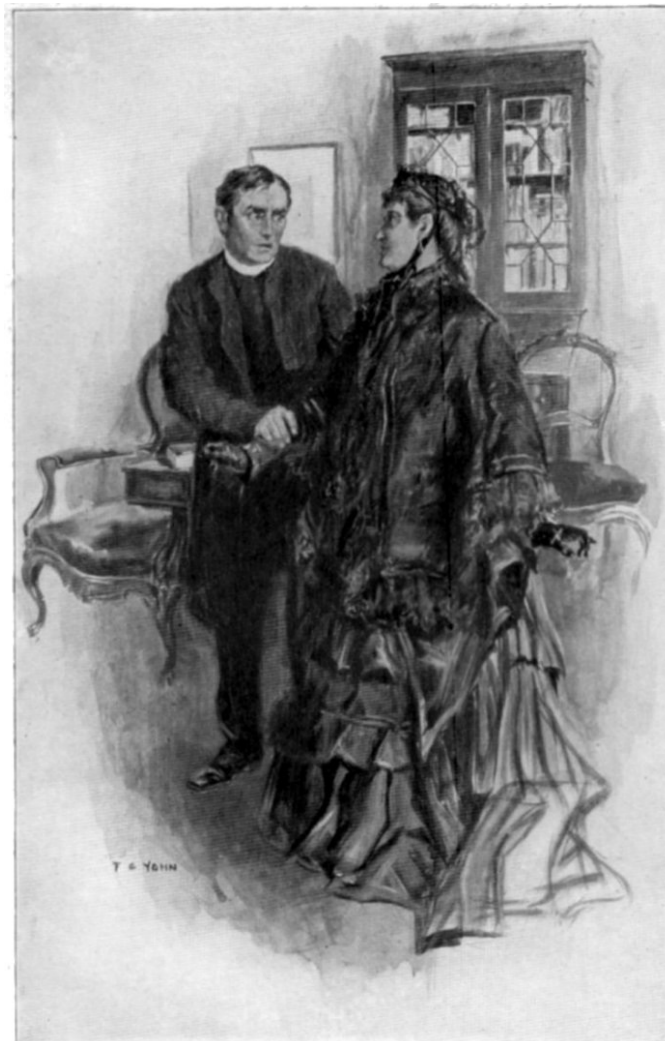
"I am waiting busily for her slayer."

He would not stir till the thing was sure.