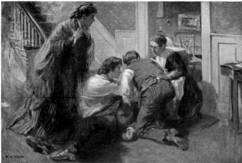
"Arthur! Arthur! Can't you speak?"

"Arthur! Arthur! can't you speak? Oh, let us move him into the library!"