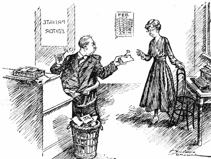
THE PAPER SHORTAGE.

In a character-sketch of VON BISSING, the Cologne Gazette says, "He is a fine musician and his execution is good." It would be.