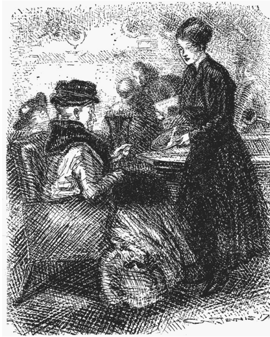
Old Lady (buying records to send to France—to assistant in Gramophone Department).

"IF THAT ONE IS THE SONG CALLED, 'THERE'S A SHIP THAT'S BOUND FOR BLIGHTY,' I'LL TAKE IT. BUT WILL YOU FIRST LET ME KNOW IF IT CONTAINS ANY INFORMATION WHICH COULD BE OF ADVANTAGE TO THE ENEMY?"