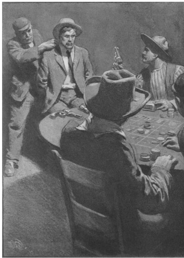
"Bart's afraid he can't duck without dying."

"Well?" growled the trainmaster, when he saw who had opened and closed the door. "Come back to tell me you've sworn off? That won't go down with Mr. Lidgerwood. When he fires, he means it."