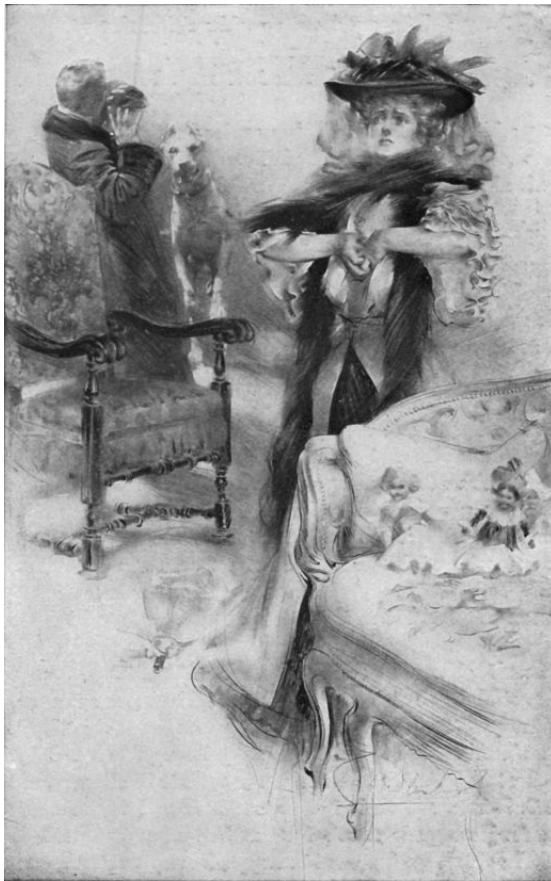
"With the acrid smell of smoke choking her."

Then the great white dog growled, very low, and the girl in the fur jacket looked around and up quickly.