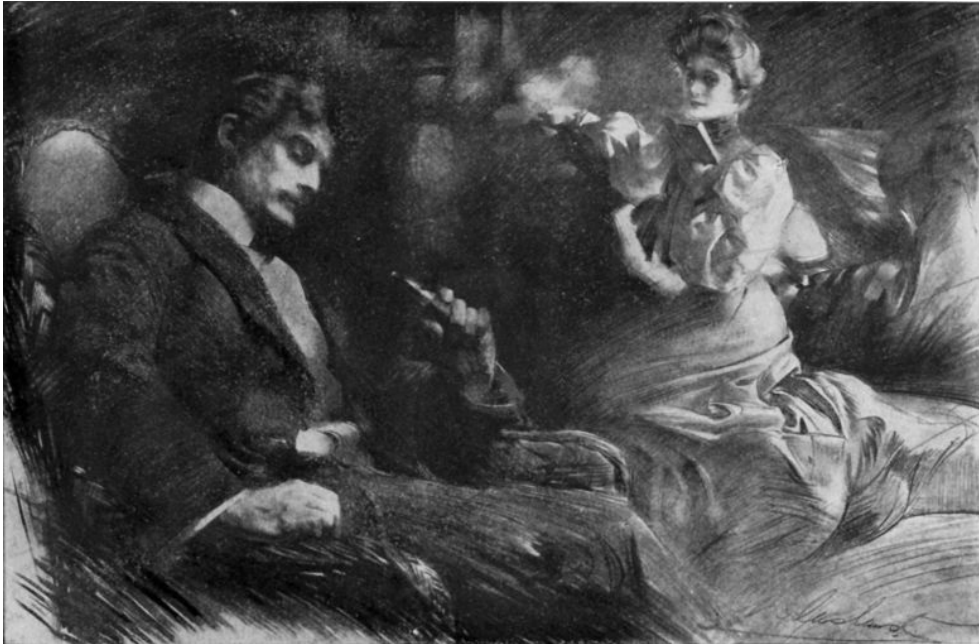
"Turning, looked straight at Selwyn."

"Is it for me? Really? Oh, please don't be provoking! Is it really for me? Then give it to me this instant!"