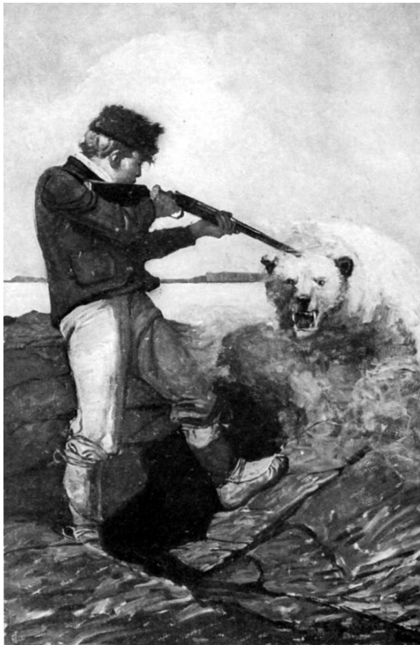
Quick as a flash Bobby raised his gun to his shoulder

This was exactly what Bobby had done. The instant he fired the shot he realized that he had not reached a vital spot. In his eagerness to secure the bear he took the chance of his single bullet disabling it. A reckless game it was, but he played it and lost.