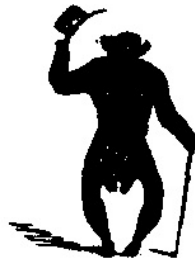
A PERFECT BEAU—(BOW)."

"What could you expect but a warped understanding ," replied the Hebrew Adonis, "from such