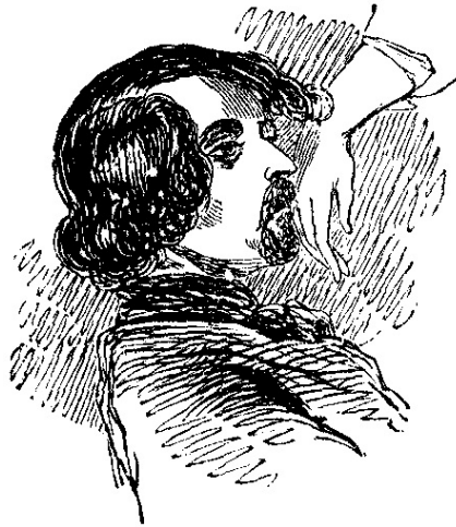
HAND AND SEAL.