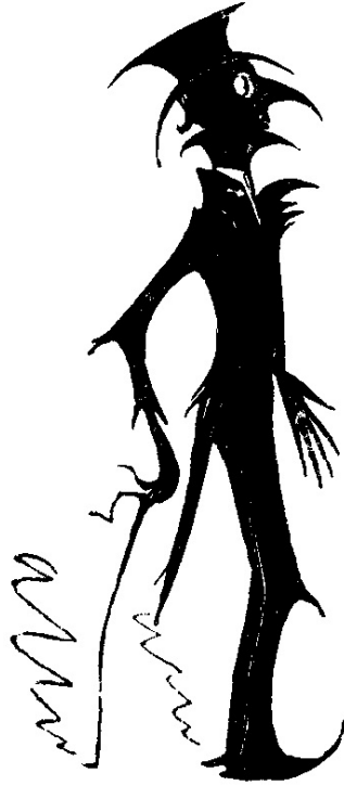
FANCY PORTRAIT OF HOOKEY WALKER.

"Upon a prima facie view, my suggestion may appear impracticable, but I am sure the above amount could be raised for the benefit of the labouring classes by one effort of royalty—an effort that would make our valued Queen invaluable, and, at the same time, afford the Ministry an opportunity of making themselves popular in the cause of their country's good. Westminster Hall is acknowledged to be the largest room in the empire, and, with very little expense, might be fitted up with a temporary throne, &c., for promenade concerts, for one, two, or three, days. All the vocal and instrumental talent of the day would be obtained gratis, and Her Most Gracious Majesty's presence, for only two hours on each day, with the admission tickets at one guinea, would produce more money than I have mentioned." Would the above amiable philanthropist favour us with his likeness? We imagine it would be a splendid