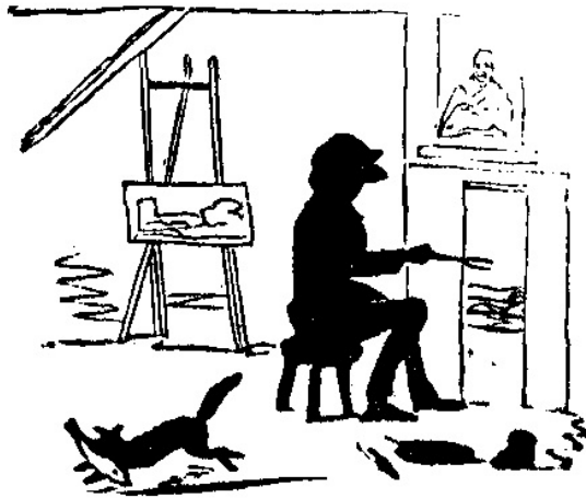
THERE'S MANY A SLIP, &c.

Hobler replied that the loss of the title was not by the late Lord Mayor but by the late Prince of Wales. But, as he sagely added,