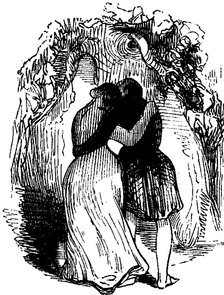
LAWS OF ATTRACTION.

torture; a thirst of the heart—an appetite which we spiritualize; a pure expansion of the soul, but which sooner or later becomes metamorphosed into an animal passion—a diamond statue with feet of clay. It is a dream—a delirium, a desire for danger, and a hope of conquest; it is that which everyone abjures, and everyone covets; it is the end, the great end, and the only end of life. Love, in short, is a tyrannical influence which none can escape; and however metaphysicians may define the passion, it appears to me that it is wholly dependent on the mysterious