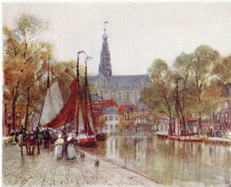
The Turf-Market, Haarlem

Haarlem being the capital of the tulip country, the time to visit it is the spring. To travel from Leyden to Haarlem by rail in April is to pass through floods of colour, reaching their finest quality about Hillegom. The beds are too formal, too exactly parallel, to be beautiful, except as sheets of scarlet or yellow; for careless beauty one must look to the heaps of blossoms piled up in the corners (later to be used on the beds as a fertiliser), which are always beautiful, and doubly so when reflected in a canal. From a balloon, in the flowering season, the tulip gardens must look like patchwork quilts.