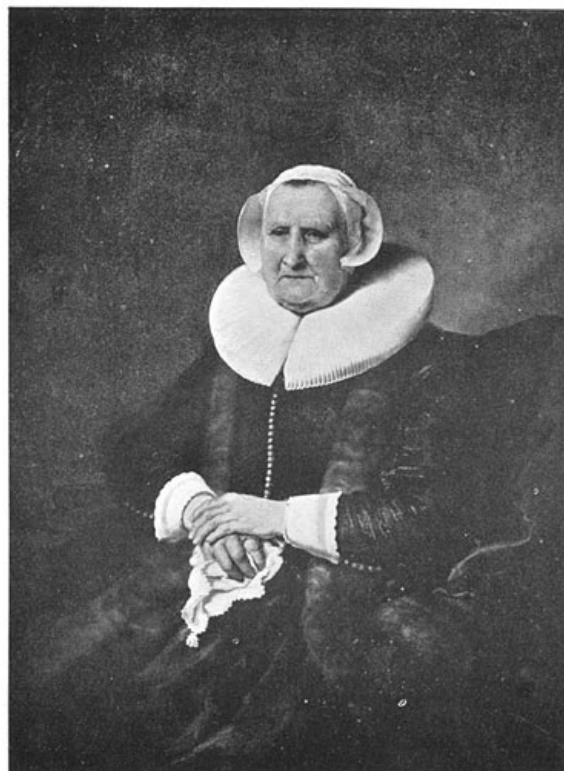
Elizabeth Bas Rembrandt

"That vengeance found soon a distinguished object. Pacheco, the chief engineer of Alva, who had accompanied the Duke in his march from Italy, who had since earned a world-wide reputation as the architect of the Antwerp citadel, had been just despatched in haste to Flushing to complete the fortress whose construction had been so long delayed. Too late for his work, too soon for his safety, the ill-fated engineer had arrived almost at the same moment with Treslong and his crew. He had stepped on shore, entirely ignorant of all which had transpired, expecting to be treated with the respect due to the chief commandant of the place, and to an officer high in the confidence of the Governor-general. He found himself surrounded by an indignant and threatening mob. The unfortunate Italian understood not a word of the opprobrious language addressed to him, but he easily comprehended that the authority of the Duke was overthrown.