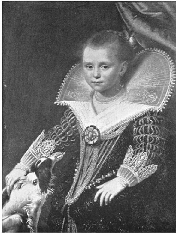
The Little Princess

M. That is my desire, that hee would graunt it.