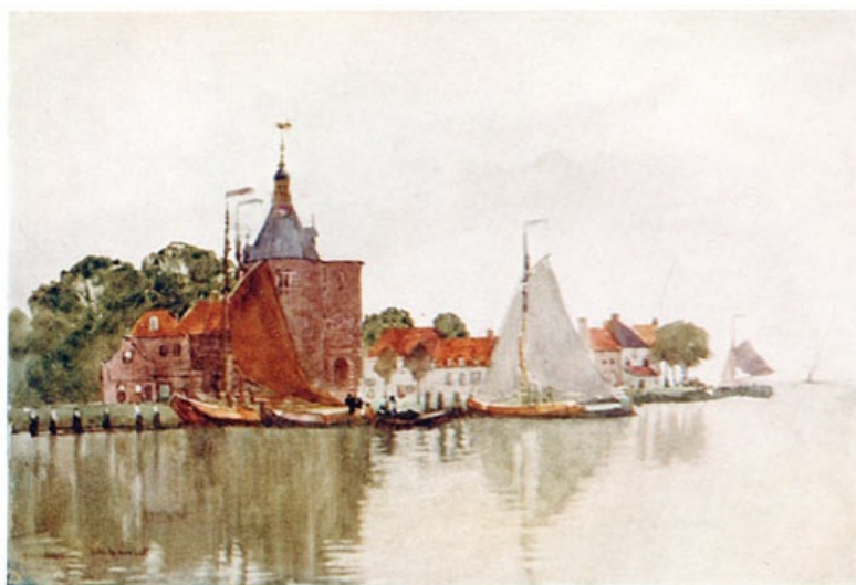
The Dromedaris Tower, Enkhuisen

Before the thirteenth century the Zuyder Zee consisted only of Lake Flevo, south of Stavoren and Enkhuisen, so that our passage then would have been made on land. But in 1282 came a great tempest which drove the German ocean over the north-west shores of Holland, insulating Texel and pouring over the low land between Holland and Friesland. The scheme now in contemplation to drain the Zuyder Zee proposes a dam from Enkhuisen to Piaam, thus reclaiming some 1,350,000 acres for meadow land. Since what man has done man can do, there is little doubt but that the Dutch will carry through this great project.