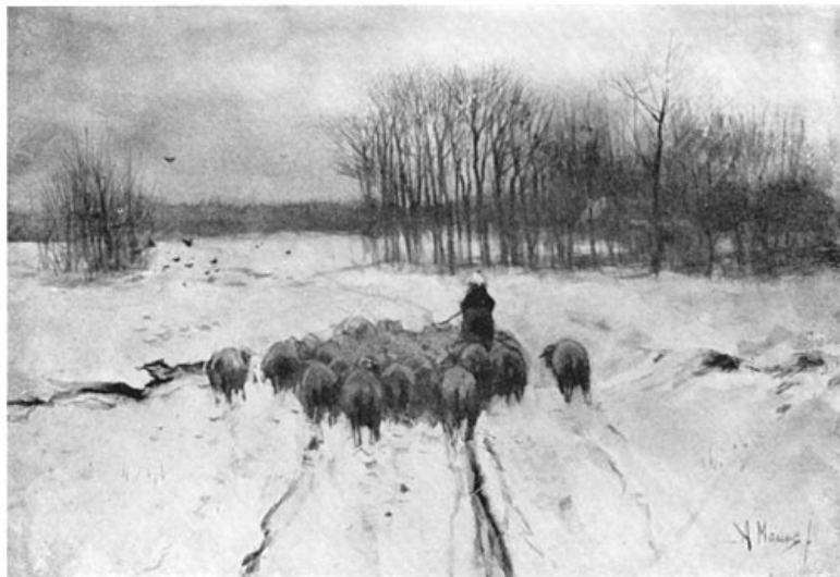
The Shepherd and His Flock

subside. While there he one day stopped a pretty Dutch girl to ask her what she had in her basket. "Eggs, mynheer." "And what is the price?" "A ducat a piece, mynheer." "Are eggs so scarce then in Holland?" "No, mynheer, but kings are."