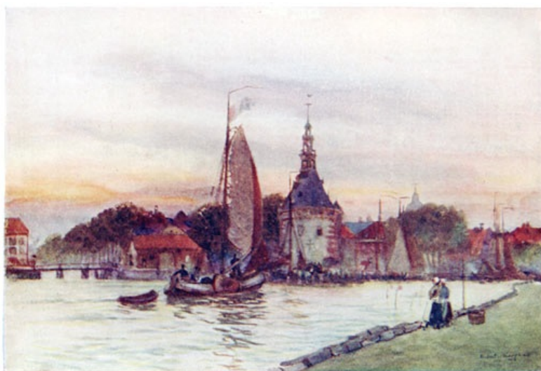
The Harbour Tower, Hoorn

It is conjectured that Hoorn took its name from the mole protecting the harbour, which might be considered to have the shape of a horn. The city as she used to be (now dwindled to something less, although the cheese industry makes her prosperous enough and happy enough) was called by the poet Vondel the trumpet and capital of the Zuyder Zee, the blessed Horn. He referred particularly to the days of Tromp, whose ravaging and victorious navy was composed largely of Hoorn ships.