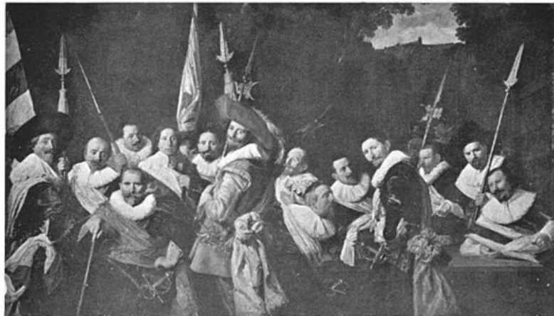
Group of Arquebusiers

Restless at times, with heavy strides He paces his parlour to and fro; He is like a ship that at anchor rides, And swings with the rising and falling tides And tugs at her anchor-tow.