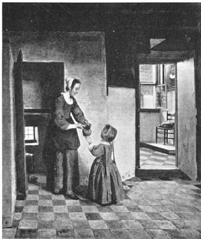
The Store Cupboard

No one has managed direct sunlight so well as De Hooch. The light in his rooms is the light of day. One can almost understand how Rembrandt and Gerard Dou got their concentrated effects of illumination; but how this omnipresent radiance streamed from De Hooch's palette is one of the mysteries. It is as though he did not paint light but found light on his canvas and painted everything else in its midst.