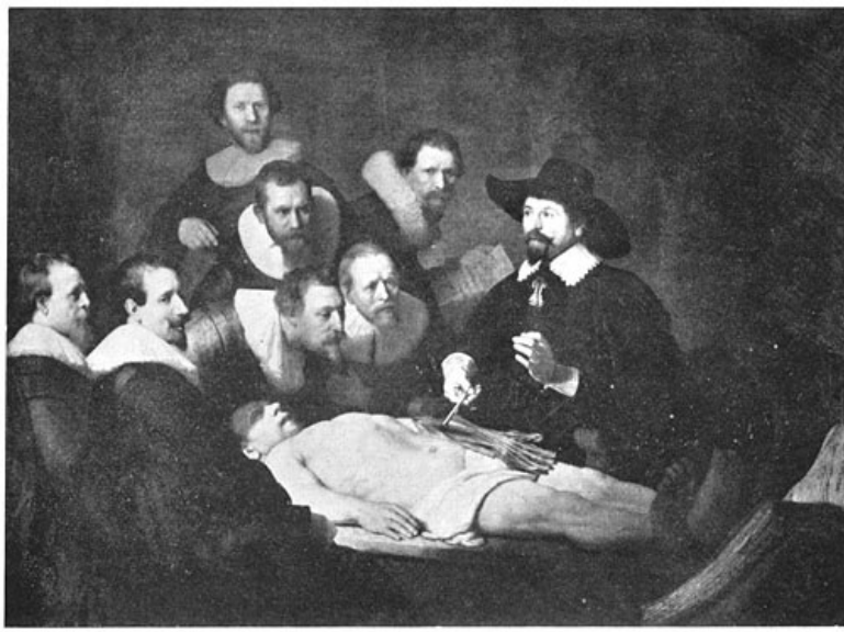
The School of Anatomy