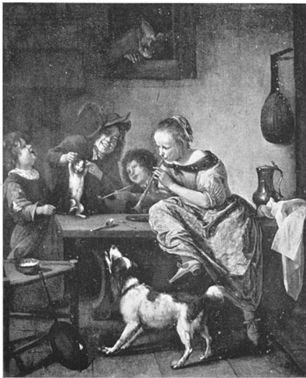
The Cat's Dancing Lesson