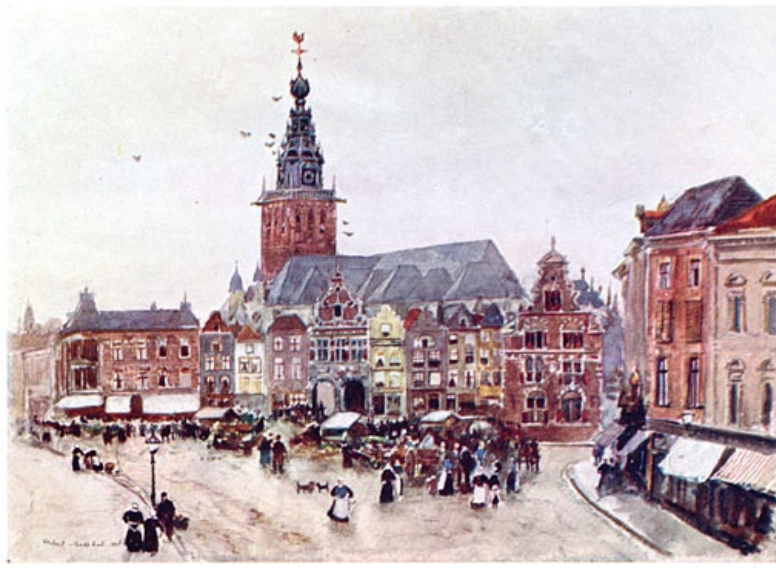
The Market Place, Nymwegen

Some versions of "Lohengrin" set the story at Nymwegen; but the Lohengrin monument is at Kleef, a few miles above the confluence of the Rhine and the Waal, the river on which Nymwegen stands.