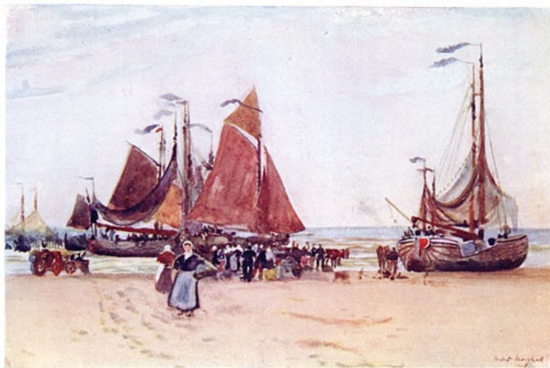
On the Beach, Scheveningen

At Rynsburg, one of the villages on the way, dwelt in 1650-51 Benedict Spinoza, the philosopher, and there he wrote his abridgement of the Meditations of Descartes, his master in philosophy, who had for a while lived close by at Endegeest. Spinoza, who was born at Amsterdam in 1632, died in 1677. His house at Rynsburg, which he shared with a Colleginat (one of a sect of Remonstrants who had their headquarters there) is now a Spinoza museum; his statue is at The Hague.