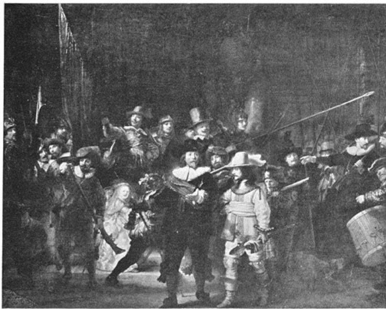
The Night Watch