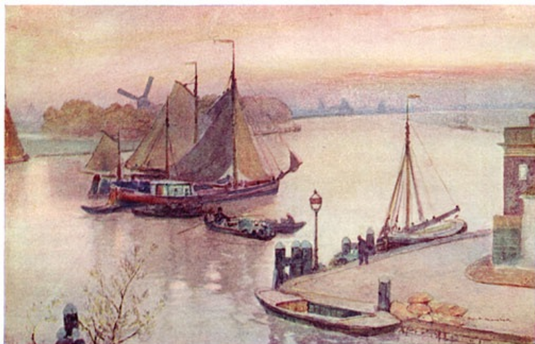
Sunrise on the Maas

*** START OF THE PROJECT GUTENBERG EBOOK A WANDERER IN HOLLAND ***