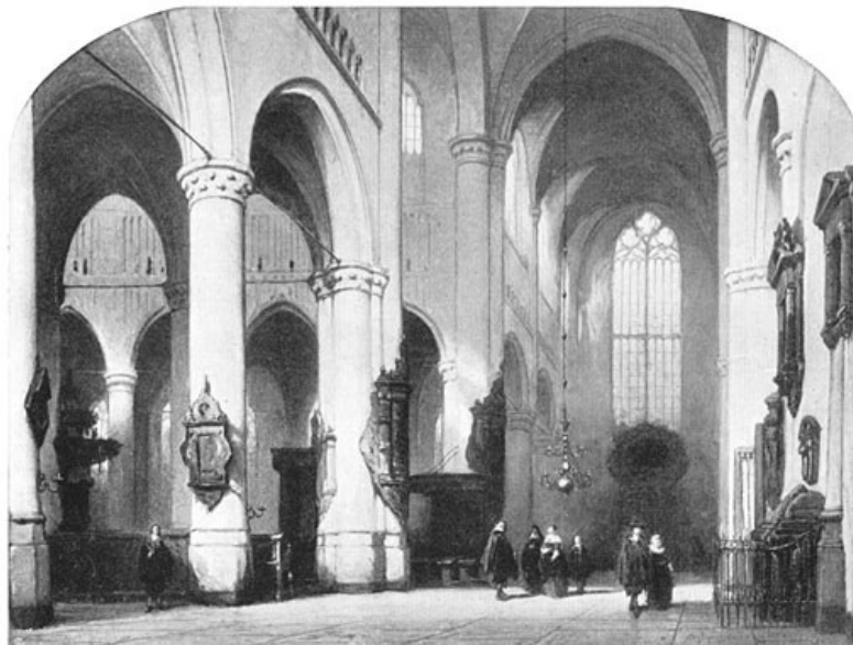
The Groote Kerk

The dunes extend for miles: an empty wilderness of sand with the grey North Sea beyond. From the high points one sees inland not only Haarlem, just below, but the domes and spires of Amsterdam beyond.