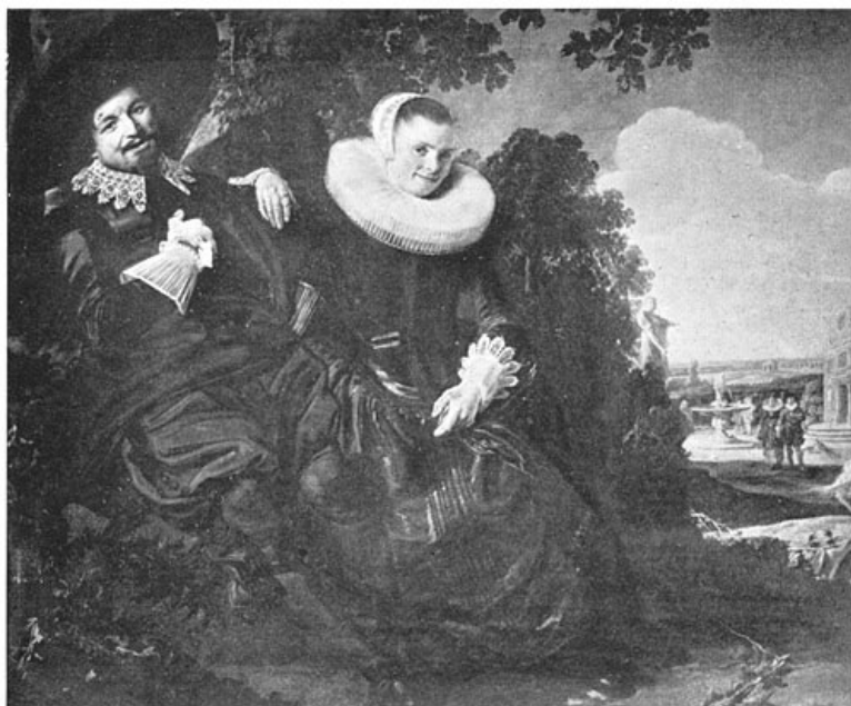
The Painter and His Wife (?)

Among Haarlem’s architectural attractions is the very interesting Meat Market, hard by the great church, one of the most agreeable pieces of floridity between the Middelburg stadhuis and the Leeuwarden chancellerie. There is also the fine Amsterdam Gate, on the road to Amsterdam.