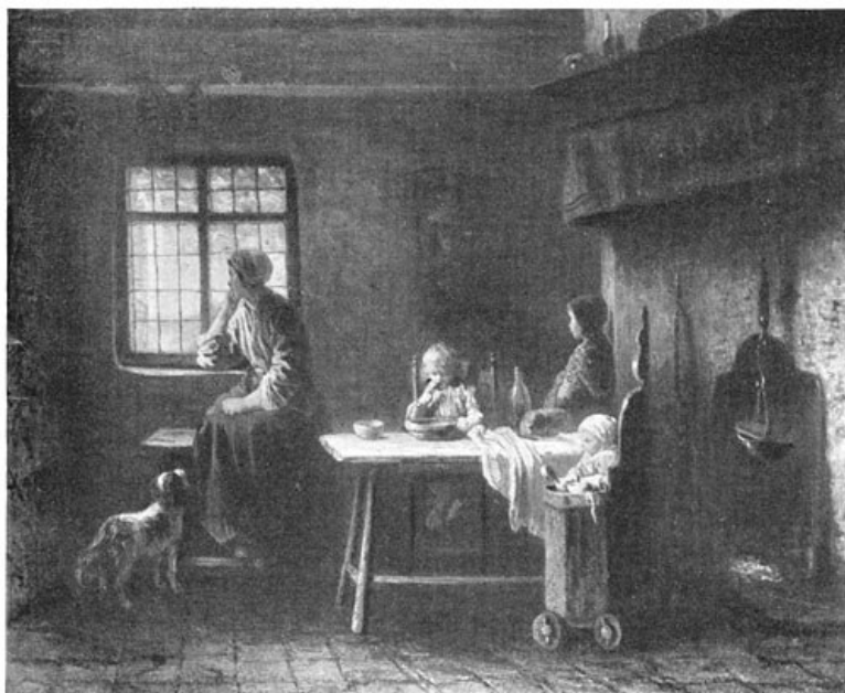
The Anxious Family