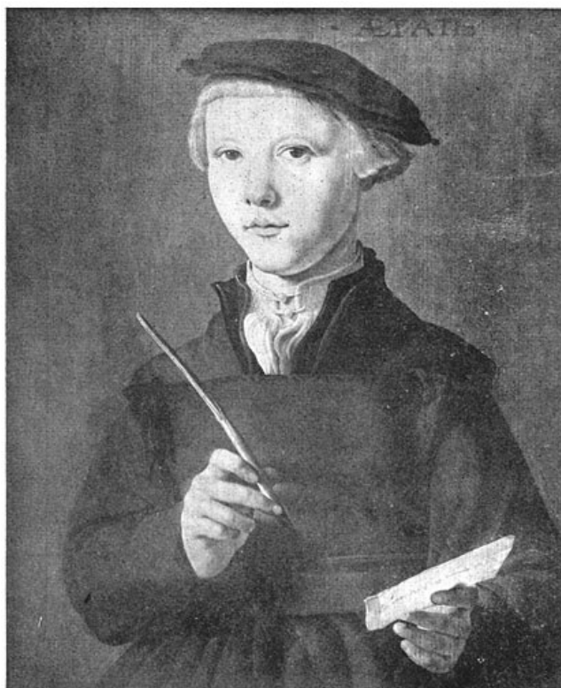
Portrait of a Youth

mere at evening, or a baby's head, or a village street. He has many moods, and he is always distinguished and subtle.