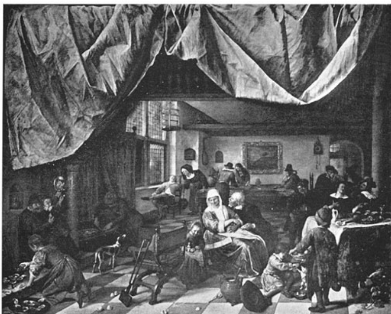
The Oyster Feast

For all his roystering and recklessness, for all his drinking and excess, Jan Steen's work is essentially delicate. He painted the sublimated essence of comedy. Teniers, Ostade, Brouwer are coarse and boorish beside him; Metsu and Mieris genteel. Even when he is painting low life Jan Steen is distinguished, a gentleman. And now and then he touches the springs of tears, so exquisite in his sympathetic understanding. He remains the most lovable painter in Holland, and the tenderest—in a country where tenderness is not easily found.