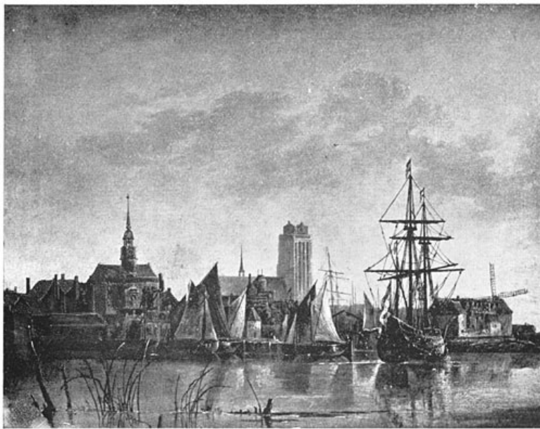
View of Dort