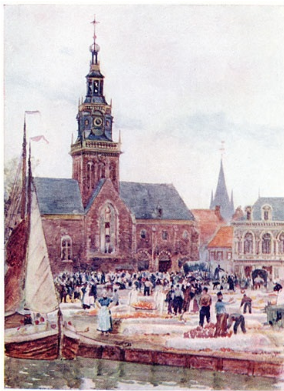
Cheese Market, Alkmaar

Alkmaar's magnet is its cheese market, which draws little companies of travellers thither every Friday in the season. To see it rightly one must reach Alkmaar on the preceding afternoon, to watch the arrival of the boats from the neighbouring farms, and see them unload their yellow freight on the market quay. The men who catch the cheeses are exceedingly adroit—it is the nearest thing to an English game that is played in Holland. Before they are finally placed in position the cheeses are liberally greased, until they glow and glitter like orange fires. All the afternoon the boats come in, with their collections from the various dairies on the water. By road also come cheeses in wagons of light polished wood painted blue within; and all the while the carillon of the beautiful grave Weigh House is ringing out its little tunes—the wedding march from “Lohengrin” among them—and the little mechanical horsemen are charging in the tourney to the blast of the little mechanical trumpeter. At one o'clock they run only a single course; but at noon the glories of Ashby-de-la-Zouche are enacted.