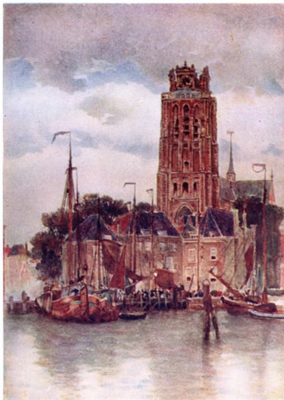
The Great Church, Dort

By the irony of fate it was Dort—the possessor of Terween's carving of the Triumph of Charles V. (a pendant to the Triumph of the Church and the Eucharist)—that, in 1572, only a few years after the carving was made, held the Congress which virtually decided the fate of Spain in the Netherlands. Brill had begun the revolution (as we shall see in our last chapter), Flushing was the first to follow suit, Enkhuisen then caught the fever; but these were individual efforts: it was the Congress of Dort that authorised and systematised the revolt.