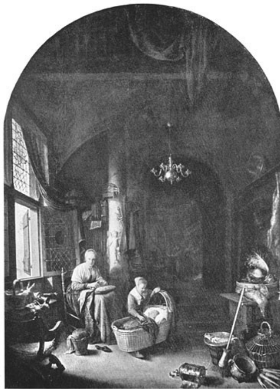
The Young Housekeeper

Gerard Dou From the picture in the Mauritshuis