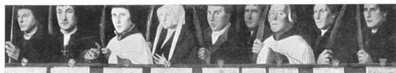
Pilgrims to Jerusalem