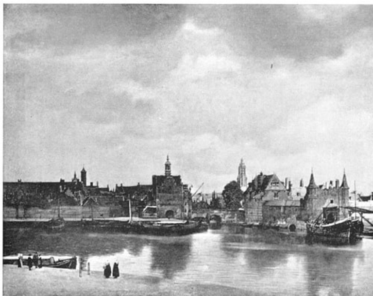
View of Delft

In several ways he made it impossible for me to avoid disregarding Clause 3 in the little guide-books; but I feel quite sure that he has not in consequence lost his situation.