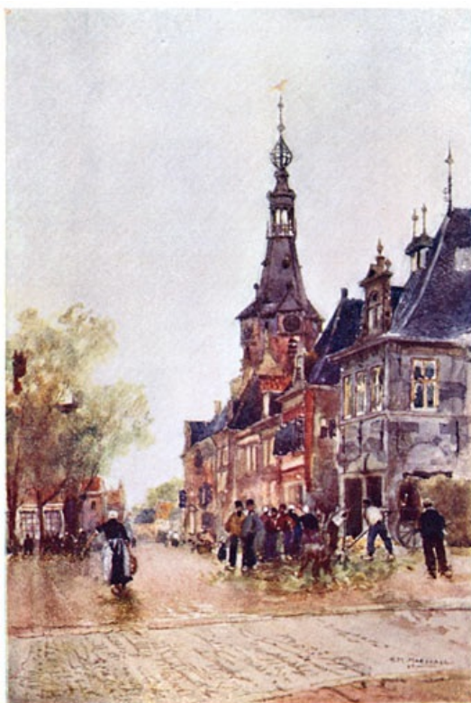
Market Place Weigh-House, Hoorn

Nieuwediep and The Helder, at the extreme north of Holland, are one, and interesting only to those to whom naval works are interesting. For they are the Portsmouth and Woolwich of the country. My memories of these twin towns are not too agreeable, for when I was there in 1897 the voyage from Amsterdam by the North Holland canal had chilled me through and through, and in 1904 it rained without ceasing. Nieuwediep is all shipping and sailors, cadet schools and hospitals. The Helder is a dull town, with the least attractive architecture I had seen, cowering beneath a huge dyke but for which, one is assured, it would lie at the bottom of the North Sea. Under rain it is a drearier town than any I know; and ordinarily it is bleak and windy, saved only by its kites, which are flown from the dyke and sail over the sea at immense heights. Every boy has a kite—one more link between Holland and China.