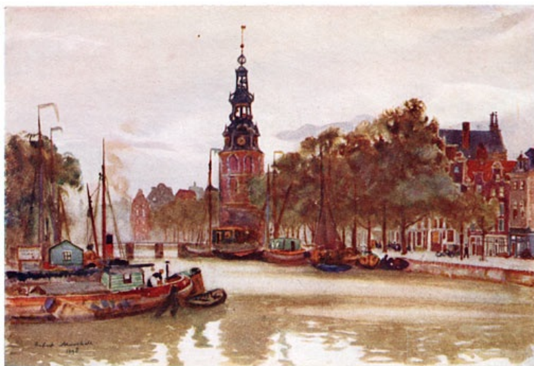
Canal in the Jews' Quarter, Amsterdam

This is the second banquet, for when the precise preliminaries of a Dutch engagement are settled a betrothal feast is held. Friends are bidden to the wedding by the receipt of a box of sweets and a bottle of wine known as "Bride's tears". For the wedding day itself there is a particular brand of wine which contains little grains of gold. The Dutch also have special cake and wine for the celebration of births.