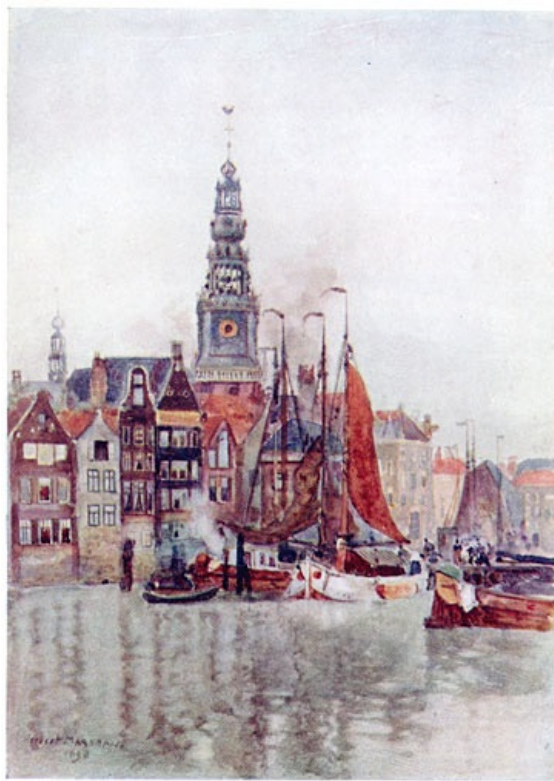
St. Nicolas Church, Amsterdam

In the main Amsterdam is a city of trade, of hurrying business men, of ceaseless clanging tramcars and crowded streets; but on the Keizersgracht and the Heerengracht you are always certain to find the old essential Dutch gravity and peace. No tide moves the sullen waters of these canals, which are lined with trees that in spring form before the narrow, dark, discreet houses the most delicate green tracery imaginable; and in summer screen them altogether. These houses are for the most part black and brown, with white window frames, and they rise to a great height, culminating in that curious stepped gable (with a crane and pulley in it) which is, to many eyes, the symbol of the city. I know no houses that so keep their secrets. In every one, I doubt not, is furniture worthy of the exterior: old paintings of Dutch gentlemen and gentlewomen, a landscape or two, a girl with a lute and a few tavern scenes; old silver windmills; and plate upon plate of serene blue Delft. (You may see what I mean in the Suasso rooms at the Stedelijk Museum.) I have walked and idled in the Keizersgracht at all times of the day, but have never seen any real signs of life. Mats have been banged on its doorsteps by clean Dutch maidservants armed with wicker beaters; milk has been brought in huge cans of brass and copper shining like the sun; but of its life proper the gracht has given no sign. Its true life is houseridden, behind those spotless and very beautiful lace curtains, and there it remains.