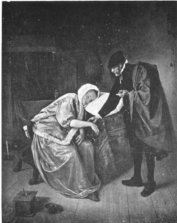
The Sick Woman

See but their mermaids, with their tails of fish, Reeking at church over the chafing-dish! A vestal turf, enshrin'd in earthen ware, Fumes through the loopholes of a wooden square; Each to the temple with these altars tend, But still does place it at her western end; While the fat steam of female sacrifice Fills the priest's nostrils, and puts out his eyes.