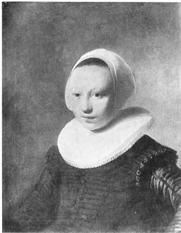
A Young Woman