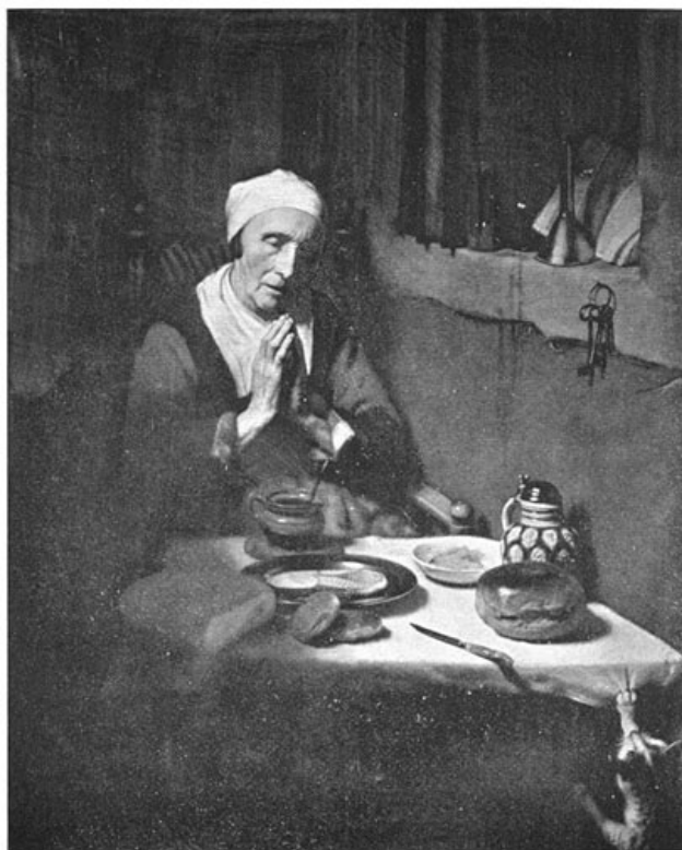
The Never-Ending Prayer

But one must go to the Ryks Museum in Amsterdam to see his finest work of all—"The Endless Prayer," No. 1501, reproduced on the opposite page. We have at the National Gallery or the Wallace Collection no Maes equal to this. His "Card players," however, at the National Gallery, a free bold canvas, more in the manner of Velasquez than of his immediate master, is in its way almost as interesting.