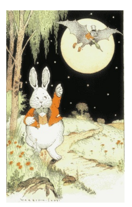
"It must be fine to fly," thought Peter. "I wish I could fly."