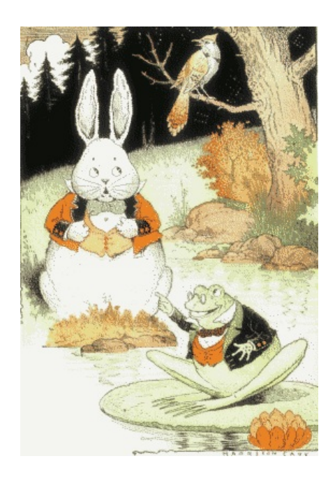
"You don't mean to say so, Peter," interrupted Grandfather Frog.

"Really! You don't mean to say so! Chug-a-rum! You don't mean to say so, Peter!" interrupted Grandfather Frog, pretending to be very much surprised at what Peter said.