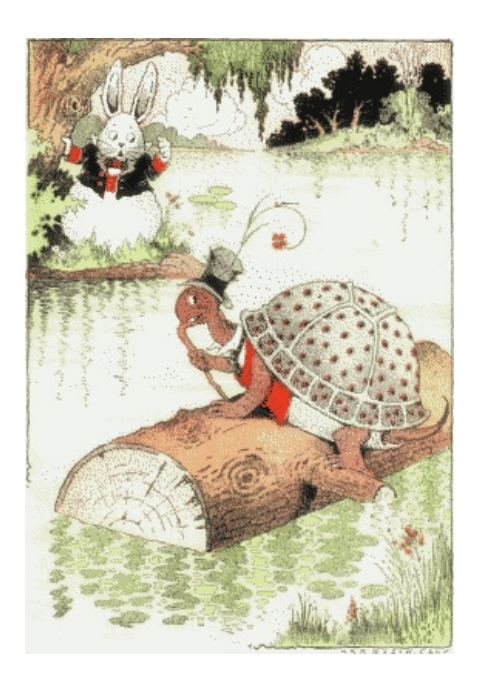
"Hi, Spotty!" he shouted. "Where do you live?"

"It is just wherever I happen to be. Just now it is right here," said Spotty. "I always take it with me wherever I go; I find it much the handiest way."