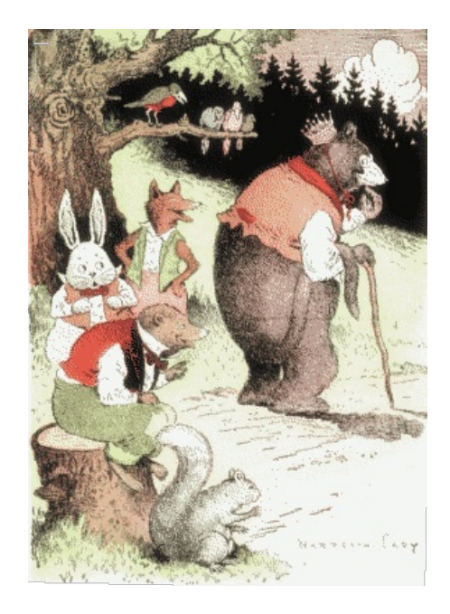
"Then Old King Bear wished that he hadn't a tail."

wished that he did have a tail. Again he lost his appetite and grew cross and peevish, so that no one dared come near him. So matters went from bad to worse, until once more Old Mother Nature visited the Green Forest to see how things were. Very humbly Old King Bear went down on his knees and begged her to take away his tail. At first Old Mother Nature refused, but he begged so hard and promised so faithfully never again to be discontented, that finally she relented and took away his tail, all but just a wee little bit. That she left as a reminder lest he should forget the lesson he had learned and should again grow envious.