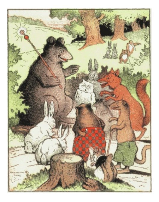
"As they were all very hungry, they would like to know when the feast would be ready."

and all very polite to Old King Bear. At first he didn't know what to make of it, but pretty soon Mr. Fox delicately hinted that they had come in response to the invitation sent by Mr. Possum, and that as they were all very hungry, they would like to know when the feast would be ready. Right away Old King Bear knew that old Mr. Possum had been up to some of his tricks, and he told his visitors that they were the victims of a practical joke.