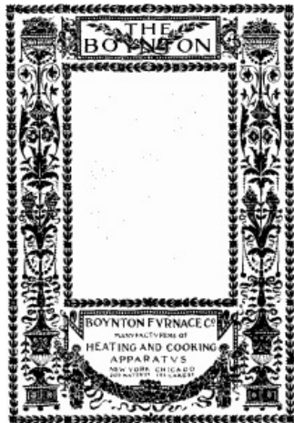
Design by Edwin R. Clark.

It must be remembered that the first consideration in this problem is the effectiveness as advertising matter of the design submitted—its artistic merits, although important, are distinctly secondary to this quality. The medium in which it is to be used and the clientage to which it is intended to appeal must also be constantly borne in mind.