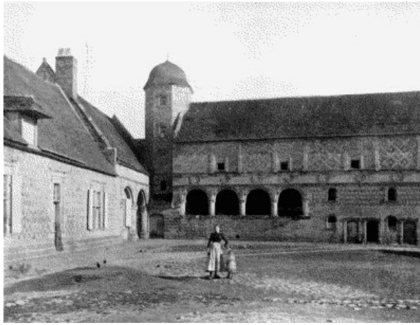
LXXXVI. Manoir d'Ango, Normandy.

passing over this design in the award is the advertising value of the attractive appearance of some of the more ornate designs.