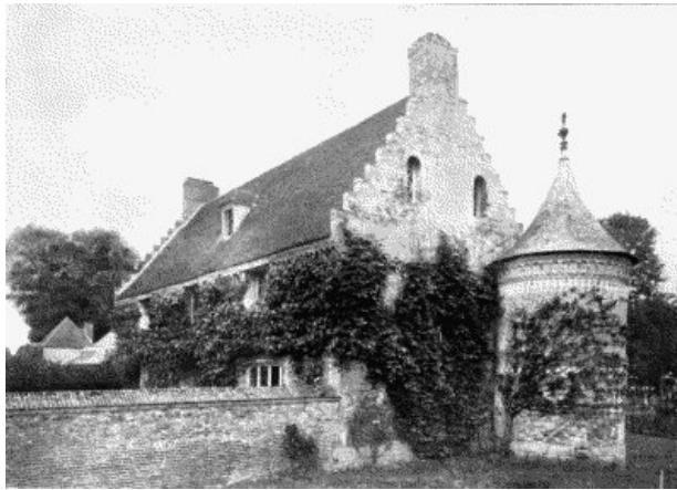
LXXXII. Manoir at Archelles, Normandy.