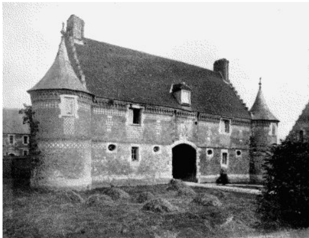
LXXXIII. Manoir at Archelles, Normandy.

ideas. We hope thus to develop in them the same good sense and good taste, the same readiness of invention and happy ingenuity, to which these masterpieces are due.