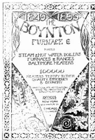
Design by Chas. F. Hogeboom, Jr.

The result in this first series of designs is especially satisfactory in the intelligence shown in grasping the essentials of the problem. All of the remaining six drawings have points of excellence to commend them, and if we had space to reproduce them would prove instructive in showing the diversity of treatment possible while fully meeting the conditions imposed.