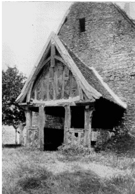
LXXXIV. Porch of Church at Beuvreil, Normandy.