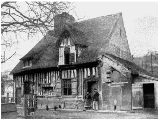
LXXXI. Ferme la Vallauine, Normandy.