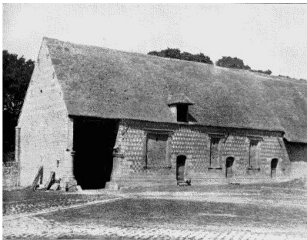
LXXXVIII. Manoir d'Ango, Normandy.