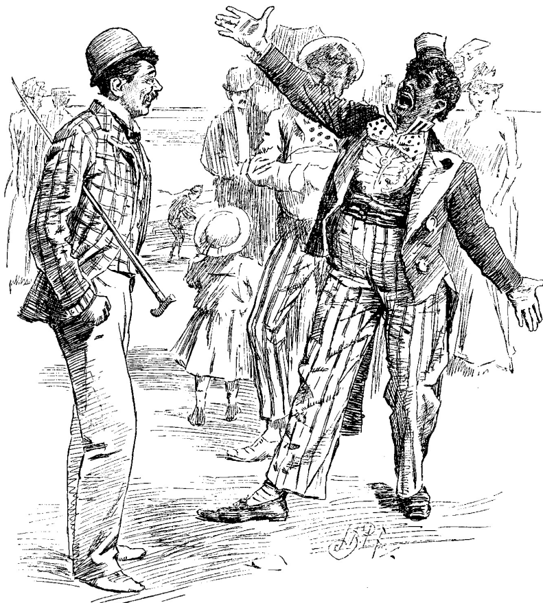
"Come to these legs!"

Bones. We shall commence this afternoon by 'olding our Grand Annual Weekly Singing Competition, for the Discouragement of Youthful Talent. Now then, which is the little gal to step out first and git a medal? ( The Children giggle, but remain seated. ) Not one? Now I arsk you —What is the use o' me comin' 'ere, throwin' away thousands and thousands of pounds on golden medals, if you won't take the trouble to stand up and sing for them? Oh, you'll make me so wild, I shall begin spittin' 'alf-sovereigns directly—I know I shall! ( A little Girl in a sun-bonnet comes forward. ) Ah, 'ere's a young lady who's bustin' with melody, I can see. Your name, my dear? Ladies and Gentleman, I