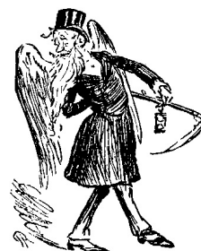
Quite a Pleasant Time.