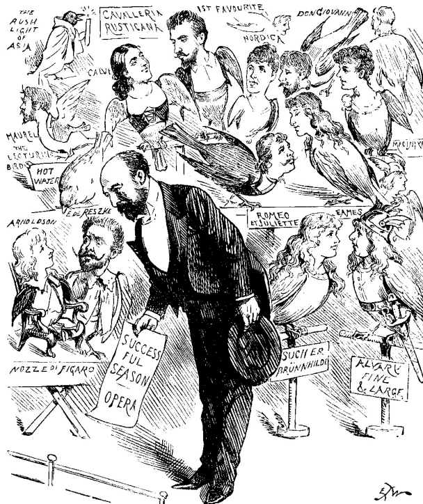
"AFTER THE OP'RA IS OVER."

phrase for the occasion, and giving, "Our Noble Shelves!"