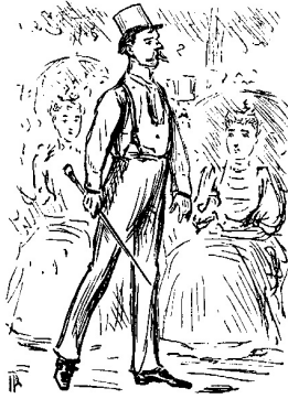
An Incomplete Suit.

have been before the Courts, and taken it again up to the Lords. The contention I have held for the last three years is at last said to be correct. We have a right to the body of PITT WELLINGTON, and when we have brought that body before the Court, the Court will order it to be educated as a Reformed Revivalist of the New Connexion. I consider the establishment of this point a great forensic victory. ( Signed ) ARTHUR BRIEFLESS, Barrister-at Law .