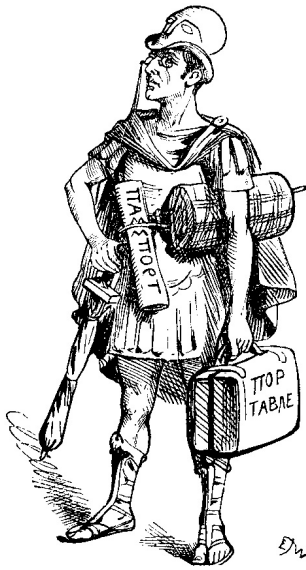
Ulysses on Tour.

Ulysses has been travelling again, and the record of his journeyings is set forth in The Modern Odyssey , which CASSELL & Co. publish in one volume, with some charming illustrations in callotype.