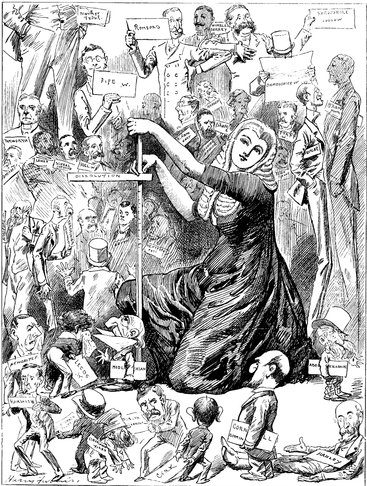
SOME UPS AND DOWNS OF THE GENERAL ELECTION.