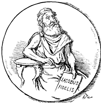
Stephensonius, B.C. (date uncertain), qui Jacobum Fidelem scripsit. (From an old Bronze Medal.)