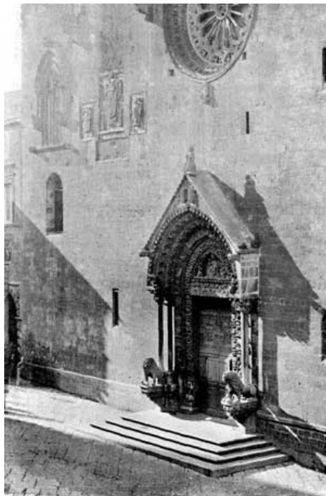
XII. A Portion of the Façade of the Basilica at Altamura, Italy.