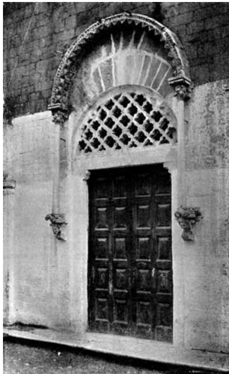
XV. Door of the Madonna di Loreto, Triani, Italy.

"The metric system is very convenient, but it is better for American students to use the English measure that they will have to use in practice, and take the tape over with them, for it is difficult to find them on the Continent. A sliding measuring-rod is nearly indispensable, and it will be most convenient to carry if it folds up to the length of the imperial drawing pad. Two large triangles are very useful in getting the projection of mouldings, as they can be held together to form a right angle."