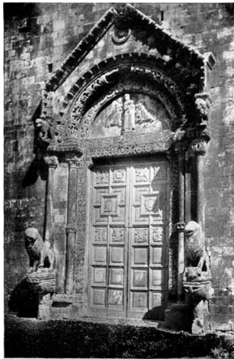
XI. The Principal Doorway to the Cathedral at Conversano, Italy.