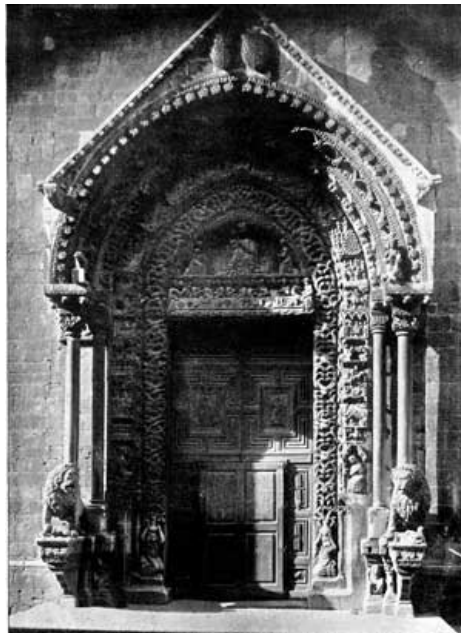
XIII. The Principal Doorway to the Basilica at Altamura, Italy.