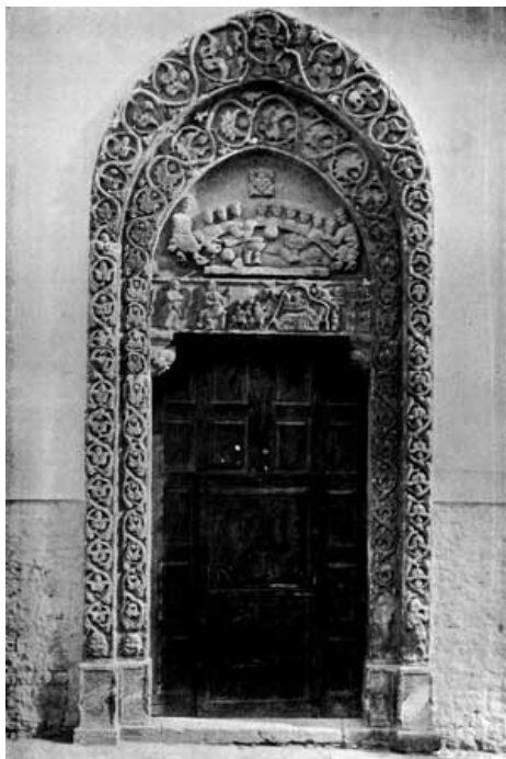
XVI. Entrance to the Church of the Rosary, Terlizzi, Italy.

*** END OF THE PROJECT GUTENBERG EBOOK THE BROCHURE SERIES OF ARCHITECTURAL ILLUSTRATION, VOL. 01, NO. 02, FEBRUARY 1895 ***