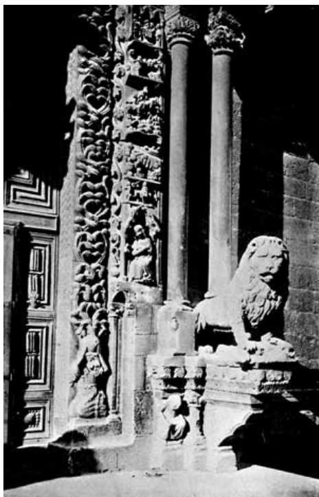
XIV. Detail of the Principal Doorway to the Basilica at Altamura, Italy.

"The reverse of this method is, to sit down in front of the building with T-square and triangle and translate the perspective building back on to paper in elevation.