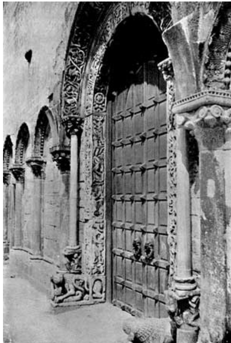
IX. The Principal Doorway to the Cathedral at Trani, Italy.

*** START OF THE PROJECT GUTENBERG EBOOK THE BROCHURE SERIES OF ARCHITECTURAL ILLUSTRATION, VOL. 01, NO. 02, FEBRUARY 1895 ***